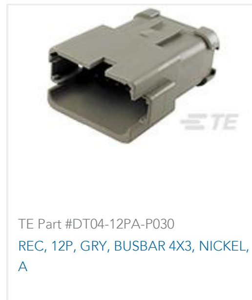
TE Part #DT04-12PA-P030 REC, 12P, GRY, BUSBAR 4X3, NICKEL, A