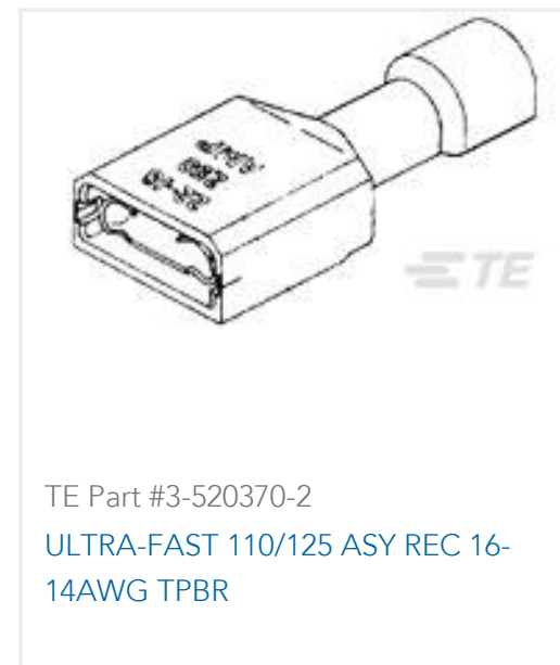
TE Part #3-520370-2 ULTRA-FAST 110/125 ASY REC 16-14AWG TPBR