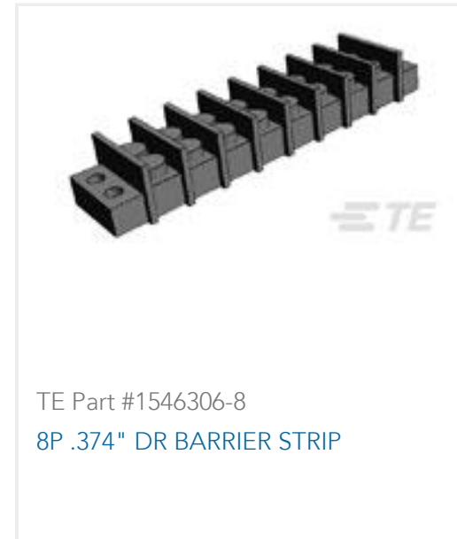
TE Part #1546306-8 8P .374" DR BARRIER STRIP