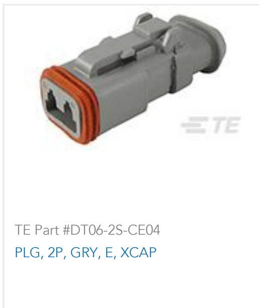
TE Part #DT06-2S-CE04 PLG, 2P, GRY, E, XCAP