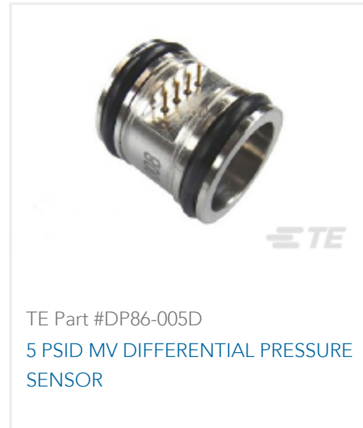
TE Part #DP86-005D 5 PSID MV DIFFERENTIAL PRESSURE SENSOR