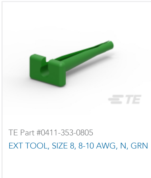
TE Part #0411-353-0805 EXT TOOL, SIZE 8, 8-10 AWG, N, GRN