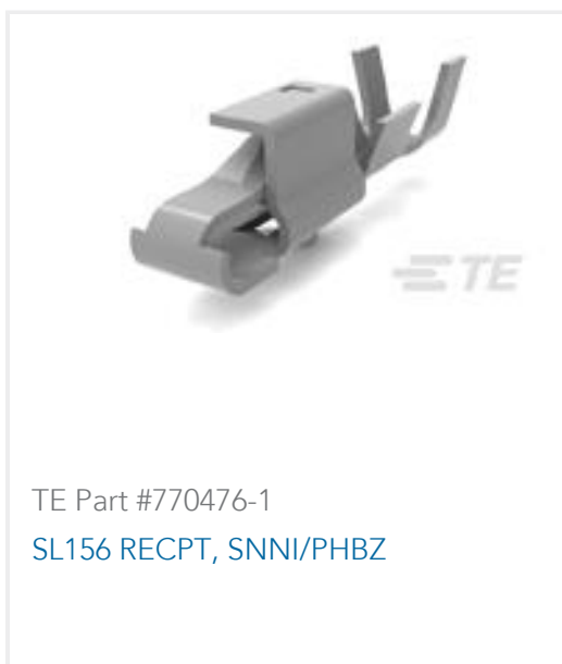
TE Part #770476-1 SL156 RECPT, SNNI/PHBZ