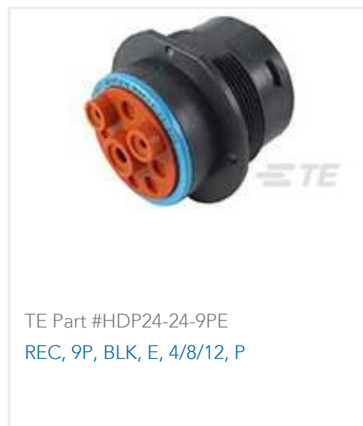
TE Part #HDP24-24-9PE REC, 9P, BLK, E, 4/8/12, P