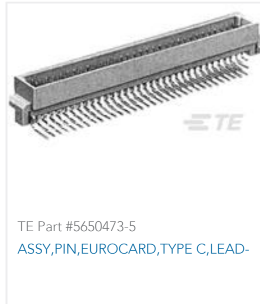
TE Part #5650473-5 ASSY,PIN,EUROCARD,TYPE C,LEAD-