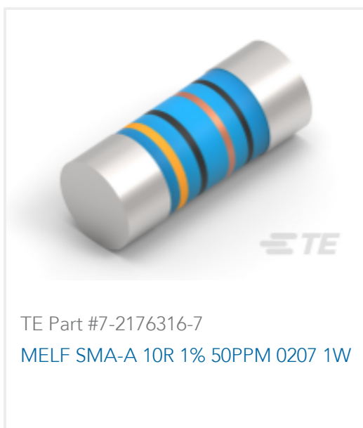
TE Part #7-2176316-7 MELF SMA-A 10R 1% 50PPM 0207 1W