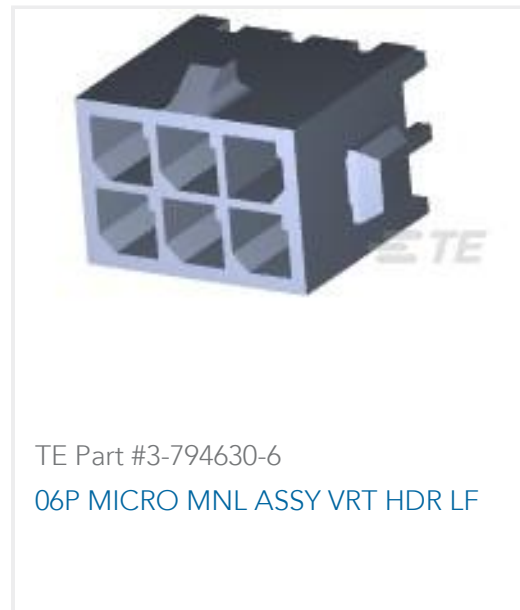
TE Part #3-794630-6 06P MICRO MNL ASSY VRT HDR LF