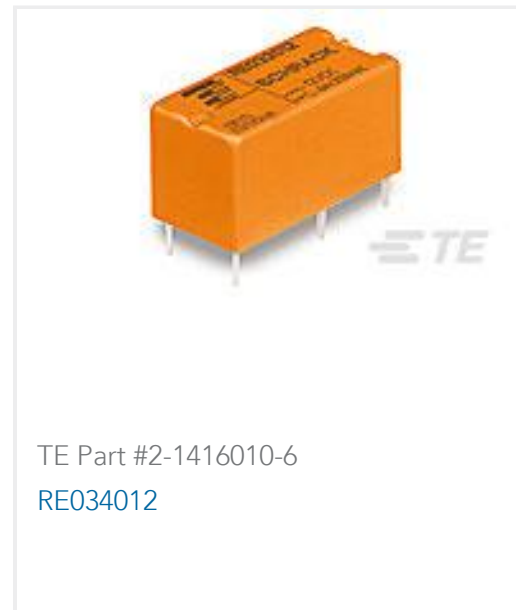
TE Part #2-1416010-6 RE034012