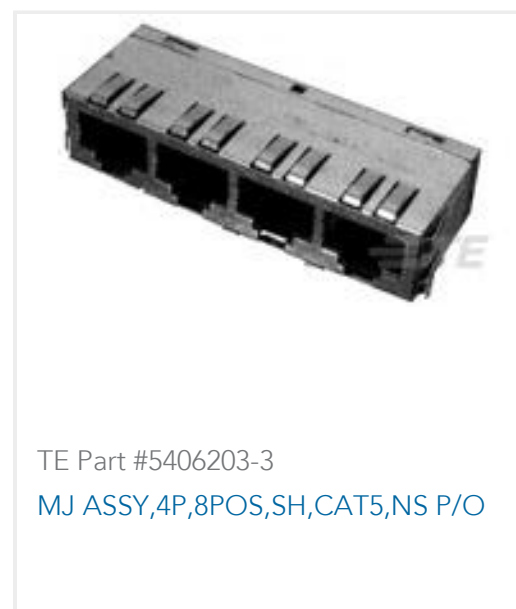
TE Part #5406203-3 MJ ASSY,4P,8POS,SH,CAT5,NS P/O