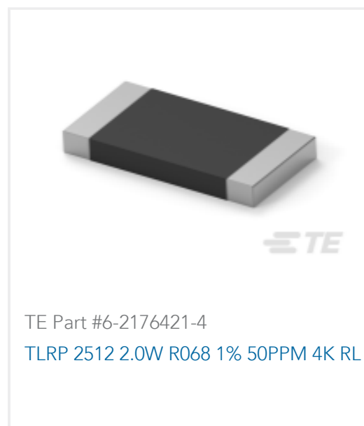
TE Part #6-2176421-4 TLRP 2512 2.0W R068 1% 50PPM 4K RL