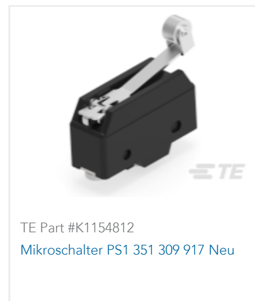
TE Part #K1154812 Mikroschalter PS1 351 309 917 Neu