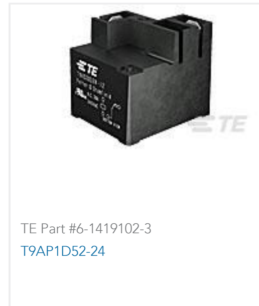
TE Part #6-1419102-3 T9AP1D52-24