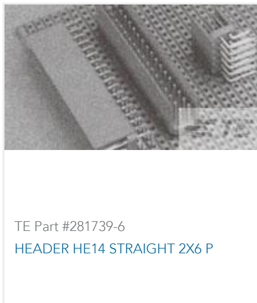
TE Part #281739-6 HEADER HE14 STRAIGHT 2X6 P