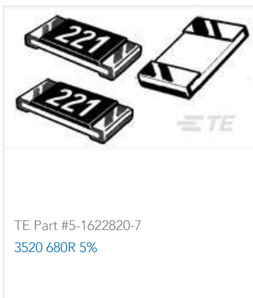
TE Part #5-1622820-7 3520 680R 5%