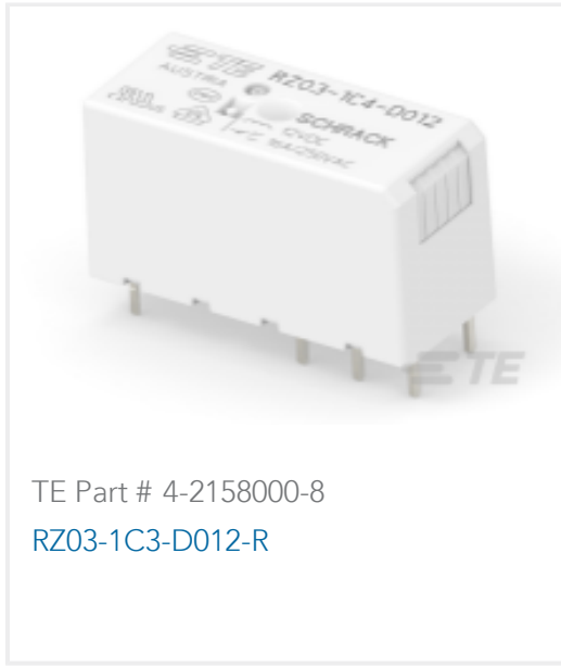
TE Part # 4-2158000-8 RZ03-1C3-D012-R