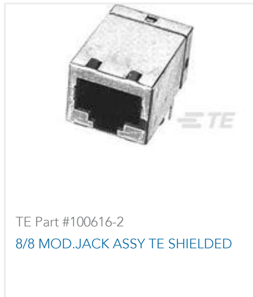
TE Part #100616-2 8/8 MOD.JACK ASSY TE SHIELDED