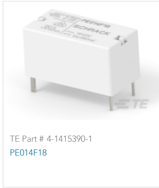
TE Part # 4-1415390-1 PE014F18