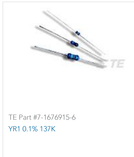
TE Part #7-1676915-6 YR1 0.1% 137K