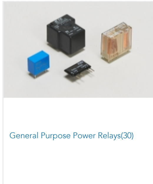
General Purpose Power Relays(30)