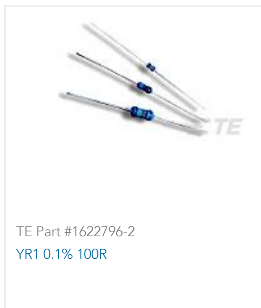
TE Part #1622796-2 YR1 0.1% 100R