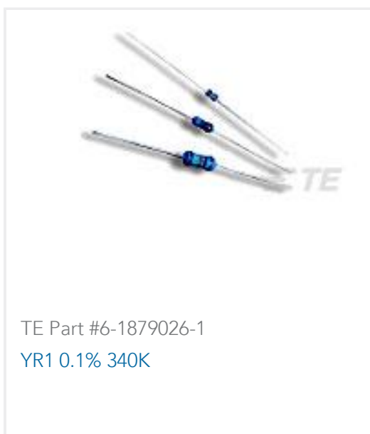
TE Part #6-1879026-1 YR1 0.1% 340K