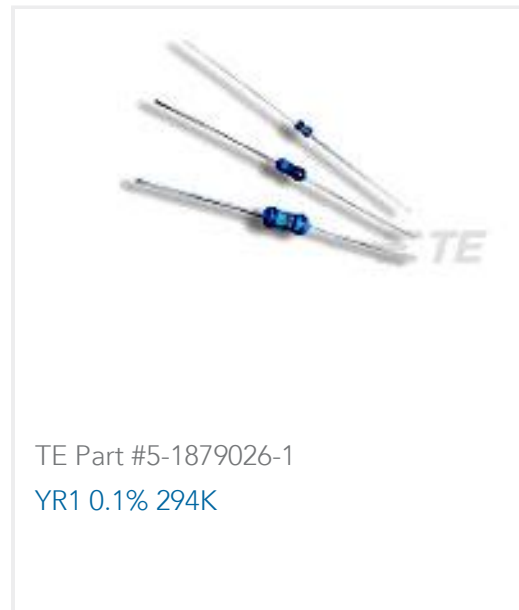
TE Part #5-1879026-1 YR1 0.1% 294K