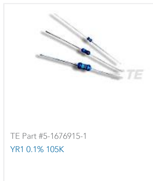
TE Part #5-1676915-1 YR1 0.1% 105K