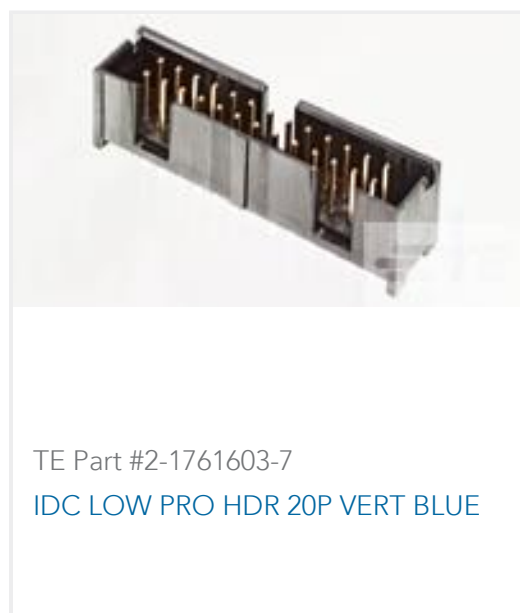
TE Part #2-1761603-7 IDC LOW PRO HDR 20P VERT BLUE