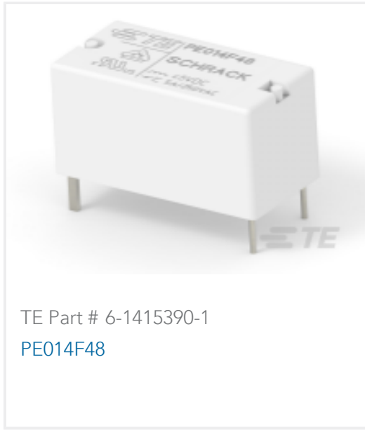
TE Part # 6-1415390-1 PE014F48