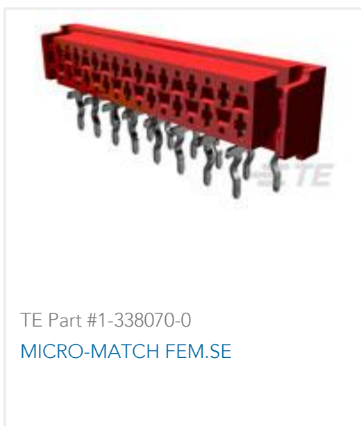
TE Part #1-338070-0 MICRO-MATCH FEM.SE