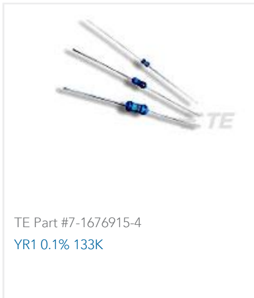
TE Part #7-1676915-4 YR1 0.1% 133K