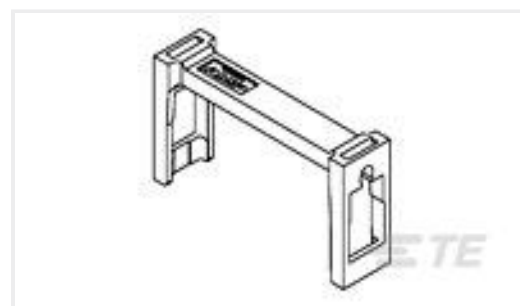
TE Part #5-100103-0 50P.A/L.STRAIN REL.