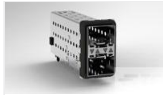
TE Part #2007538-5 SFP+assy 2x1 Gasket 4 LP Sn