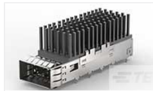
TE Part #2170704-3 CAGE ASSY, QSFP28 1X1, SPRING, HS