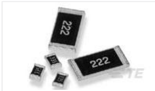
TE Part #2-2176185-4 CRGH0805 1% 56K 0.33W