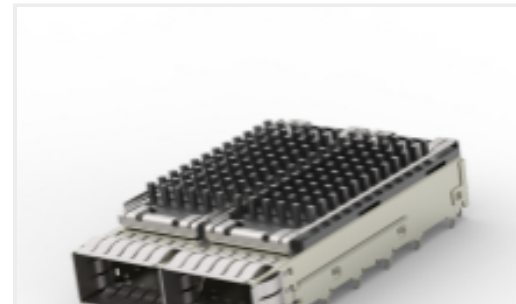
TE Part #2170806-2 CAGE ASSEMBLY, 1X2, QSFP28, SPRING, HS