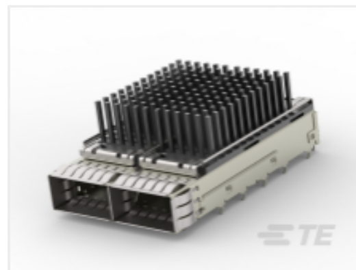
TE Part #2170806-3 CAGE ASSEMBLY, 1X2, QSFP28, SPRING, HS