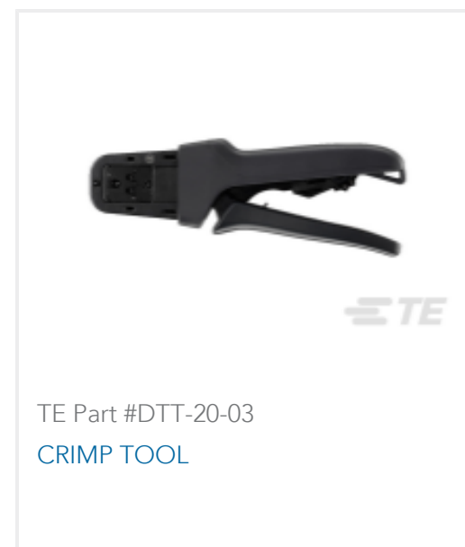
TE Part #DTT-20-03 CRIMP TOOL