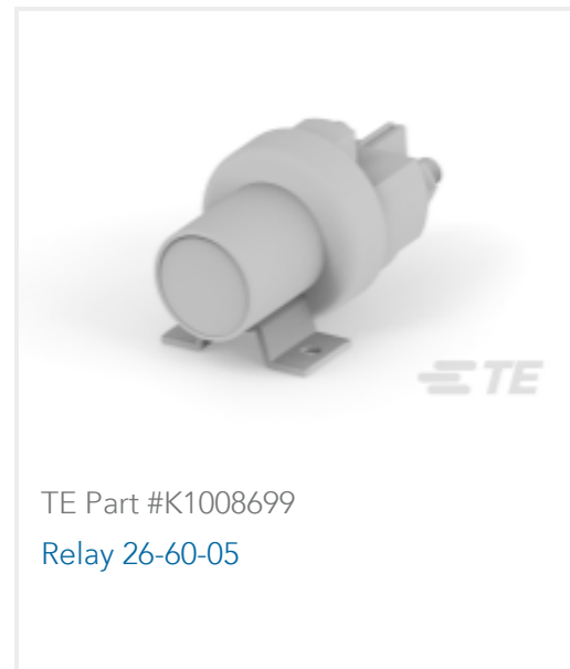
TE Part #K1008699 Relay 26-60-05