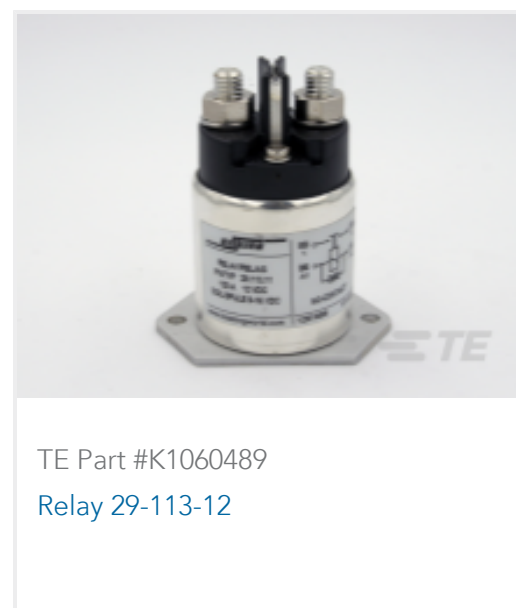
TE Part #K1060489 Relay 29-113-12