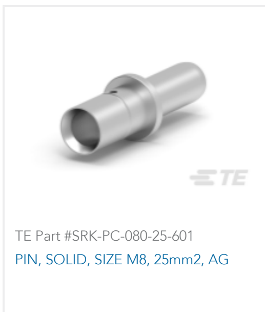
TE Part #SRK-PC-080-25-601 PIN, SOLID, SIZE M8, 25mm2, AG