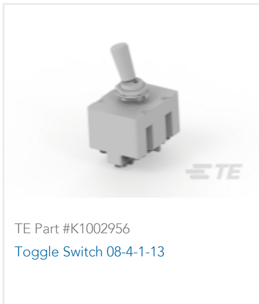
TE Part #K1002956 Toggle Switch 08-4-1-13