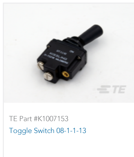
TE Part #K1007153 Toggle Switch 08-1-1-13