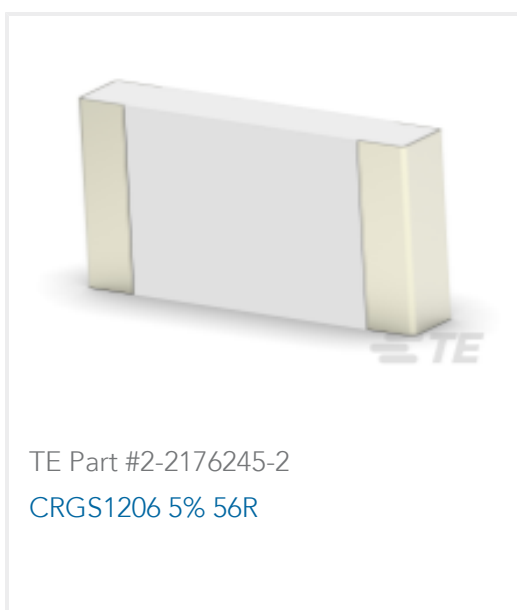
TE Part #2-2176245-2 CRGS1206 5% 56R