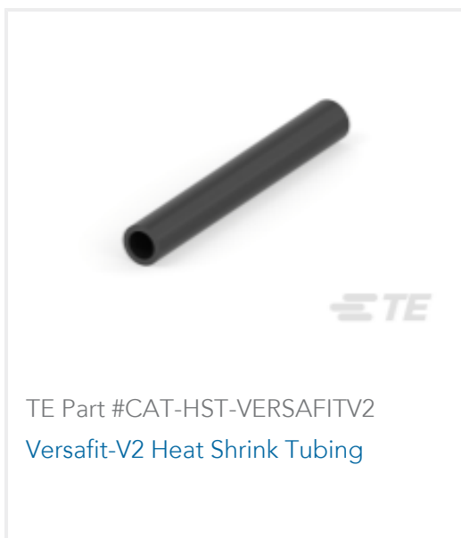
TE Part #CAT-HST-VERSAFITV2 Versafit-V2 Heat Shrink Tubing