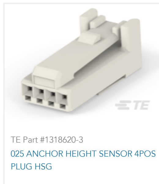
TE Part #1318620-3 025 ANCHOR HEIGHT SENSOR 4POS PLUG HSG