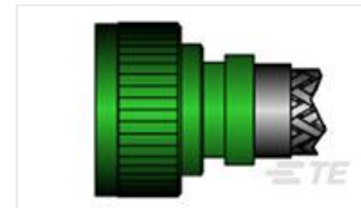
TE Part #722623-000 203M010-19B05