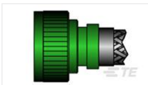
TE Part #898209-000 204M010-19B06