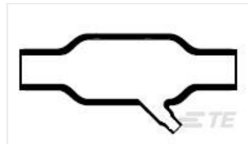
TE Part #829099-000 342A024-25-0