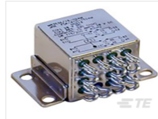
TE Part #1617806-7 TD228-2001P=TDFO 2 SEC M83726 /28-2001P