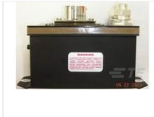
TE Part #4-1616058-4 A770WF=RELAY