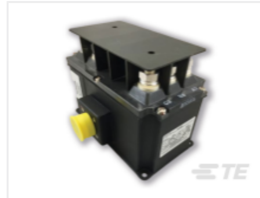
TE Part #CAT-3PDT-AC-CONT AC Contactors: 3PDT