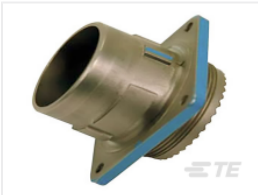
TE Part #YDIV46E11-05SNC003 PLUG ASSY