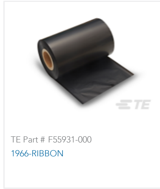
TE Part # F55931-000 1966-RIBBON