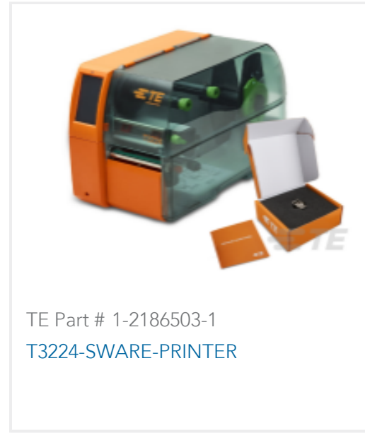
TE Part # 1-2186503-1 T3224-SWARE-PRINTER