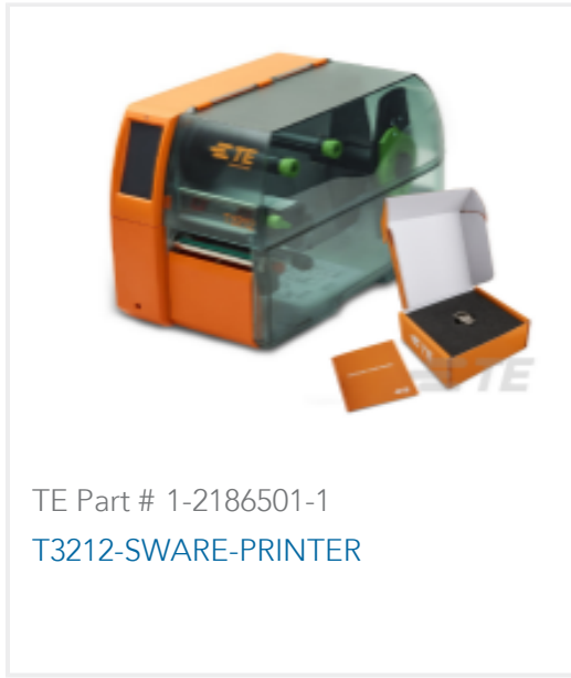
TE Part # 1-2186501-1 T3212-SWARE-PRINTER