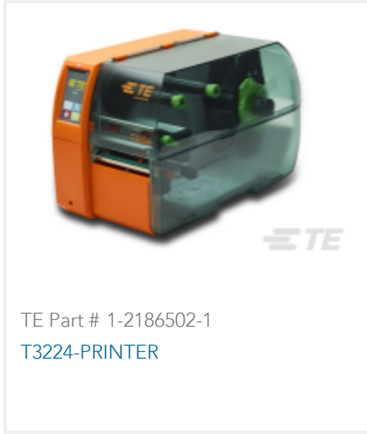
TE Part # 1-2186502-1 T3224-PRINTER