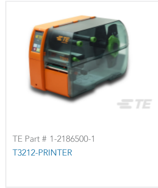
TE Part # 1-2186500-1 T3212-PRINTER