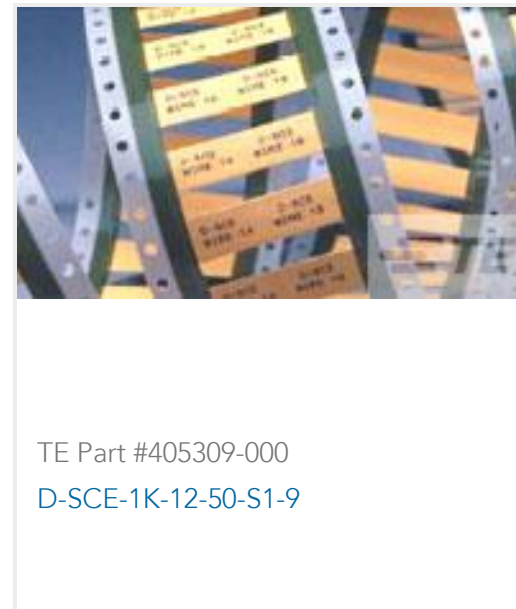
TE Part #405309-000 D-SCE-1K-12-50-S1-9