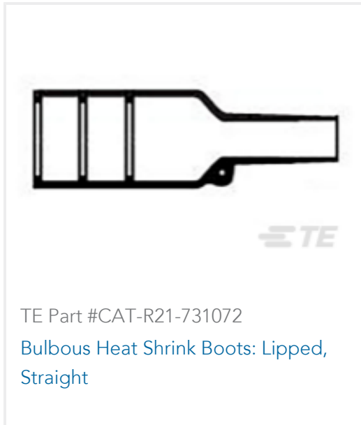
TE Part #CAT-R21-731072 Bulbous Heat Shrink Boots: Lipped, Straight