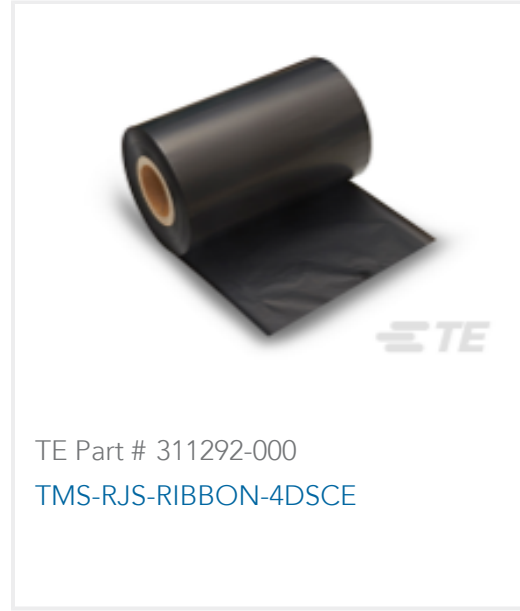
TE Part # 311292-000 TMS-RJS-RIBBON-4DSCE