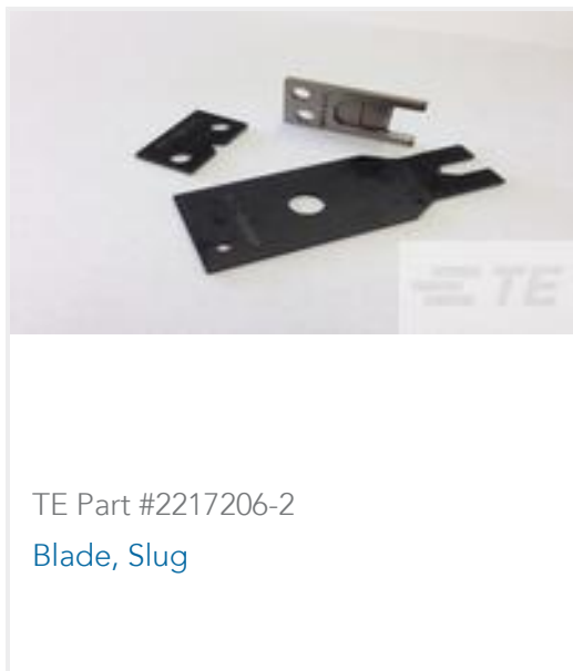
TE Part #2217206-2 Blade, Slug