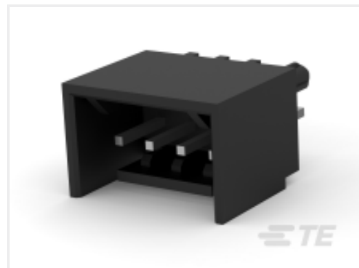
TE Part # CAT-104MTA-PVSHH Polyester Vertical PCB Header: 2.54 mm, Shrouded, MTA 100