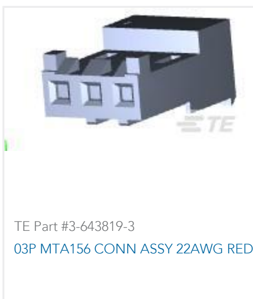
TE Part #3-643819-3 03P MTA156 CONN ASSY 22AWG RED