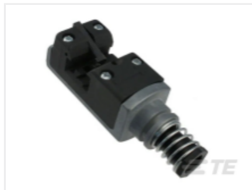
TE Part # 58246-1 MTA 100 CRIMP HEAD REPAIR DISCRETE