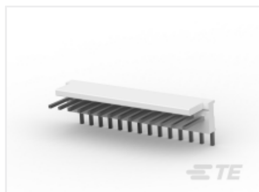
TE Part # 1-640455-4 14P MTA100 HDR ASSY SQ R/A POL