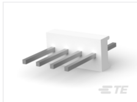
TE Part # CAT-104MTA-PVUNH PCB Header: Polyester, Vertical, Unshrouded, No Mating Alignment