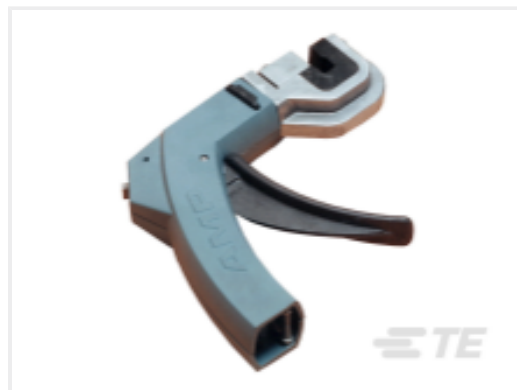
TE Part # 58579-1 MTA 100 MANUAL TOOL ASSEMBLY DISCRETE