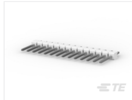
TE Part # 4-644456-4 14P MTA100 HDR ASSY (NARROW)