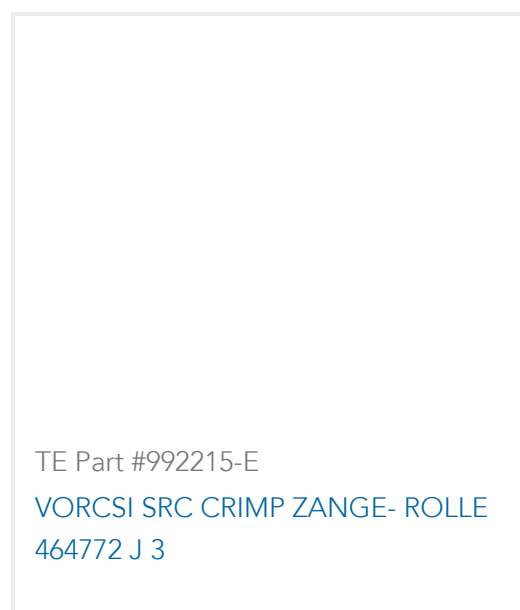
TE Part #992215-E VORCSI SRC CRIMP ZANGE- ROLLE 464772 J 3