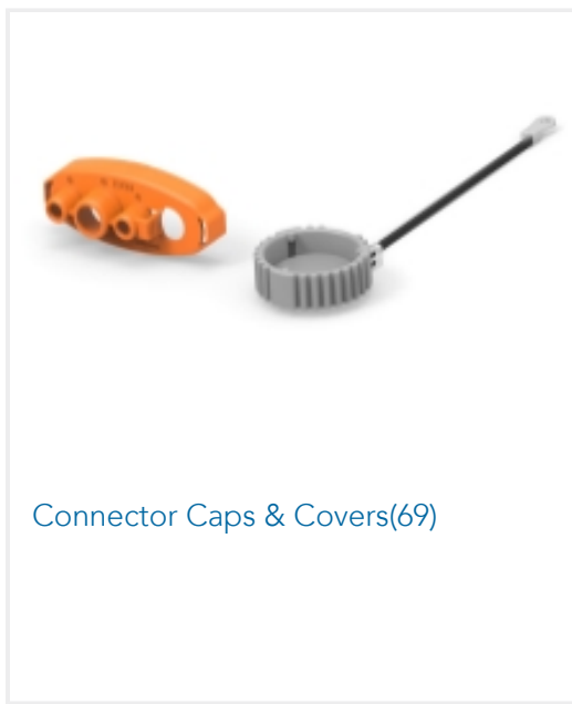
Connector Caps & Covers(69)