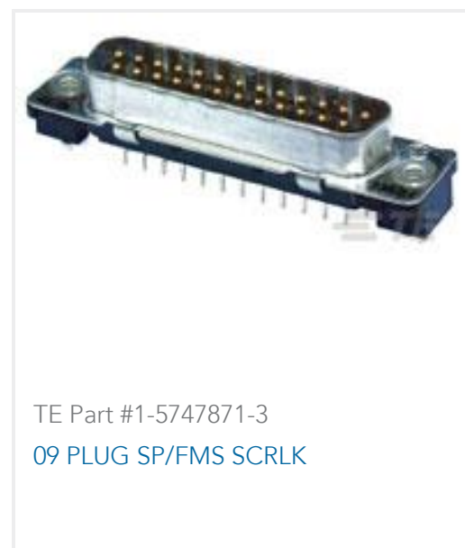
TE Part #1-5747871-3 09 PLUG SP/FMS SCRLK