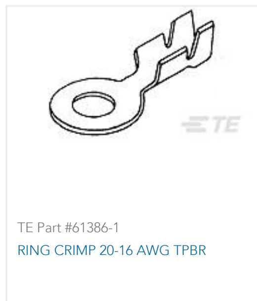
TE Part #61386-1 RING CRIMP 20-16 AWG TPBR