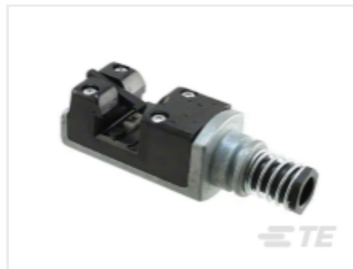
TE Part # 58246-3 MTA 100 CRIMP HEAD PRODUCTION RBBN CABLE