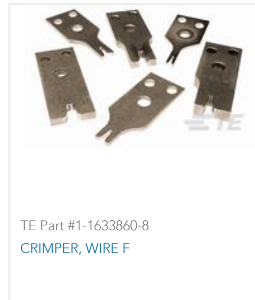
TE Part #1-1633860-8 CRIMPER, WIRE F