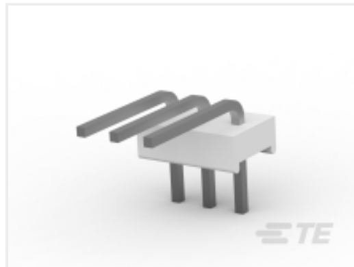
TE Part # CAT-104MTA-PRUSH PCB Header: Polyester, Right Angle, Unshrouded