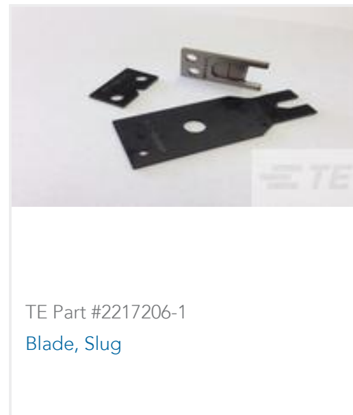
TE Part #2217206-1 Blade, Slug