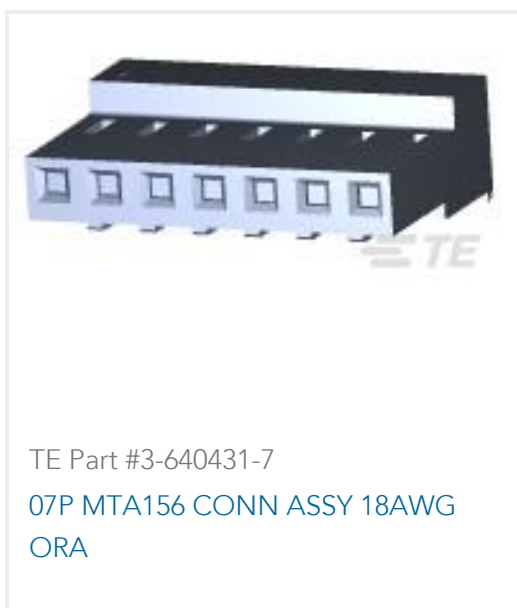
TE Part #3-640431-7 07P MTA156 CONN ASSY 18AWG ORA