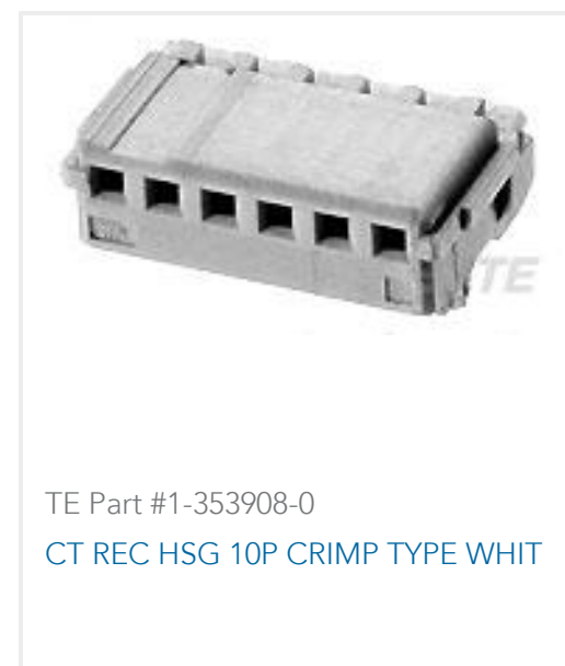
TE Part #1-353908-0 CT REC HSG 10P CRIMP TYPE WHIT