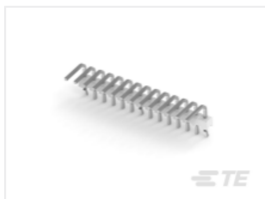
TE Part # 4-644694-4 14P MTA100 R/A HDR RETENTIVE