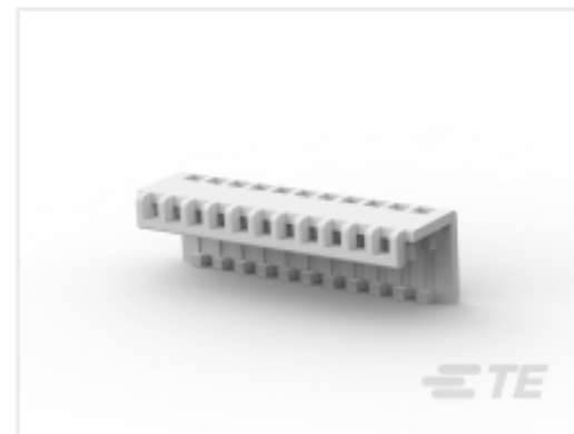
TE Part # CAT-104MTA-NYLCC Nylon PCB Connector Covers: 2.54 mm, MTA 100