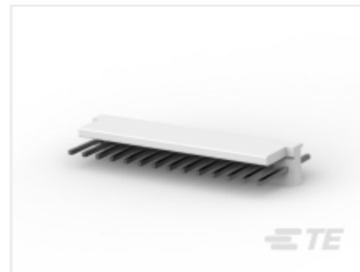
TE Part # 1-640454-4 14P MTA100 HDR ASSY SQ STR POL