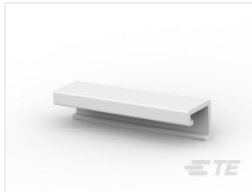
TE Part # 1-640550-4 14P MTA100 COVER