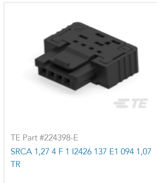
TE Part #224398-E SRCA 1,27 4 F 1 I2426 137 E1 094 1,07 TR