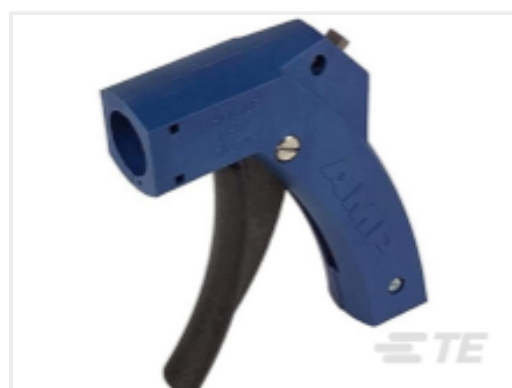
TE Part # 58074-1 MTA 50/100/156 MANUAL TOOL FRAME