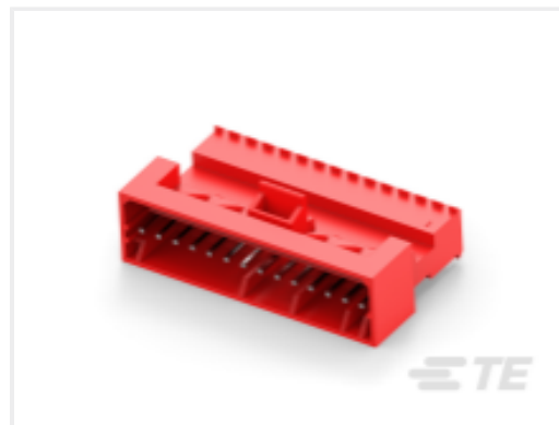
TE Part # 4-647000-4 14P MTA100 PSTD CONN ASSY LF