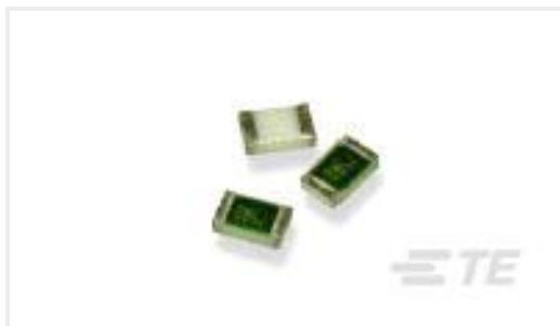
TE Part #6-1676481-1 CPF 0603 2K0 0.1% 25PPM 1K RL