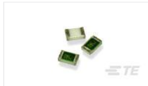
TE Part #3-1879216-3 CPF0402 160K 0.1% 25PPM 1K RL