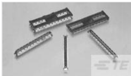
TE Part #3-1827253-6 .5FHP05H,220,S,GIG,08/Sn,HT,NSYes