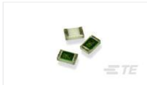
TE Part #7-1879215-4 CPF 0402 26K7 0.1% 25PPM 1K RL