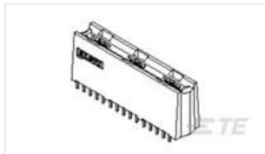
TE Part #6650383-1 284-0102-11300=CONN,SKT,COMP