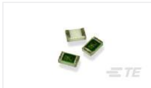
TE Part #1879215-6 CPF 0402 4K53 0.1% 25PPM 1K RL