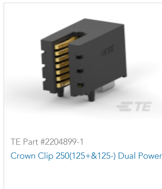
TE Part #2204899-1 Crown Clip 250(125+&125-) Dual Power