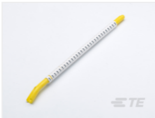
TE Part #CAT-T3437-ST2999 STD Snap-On Markers