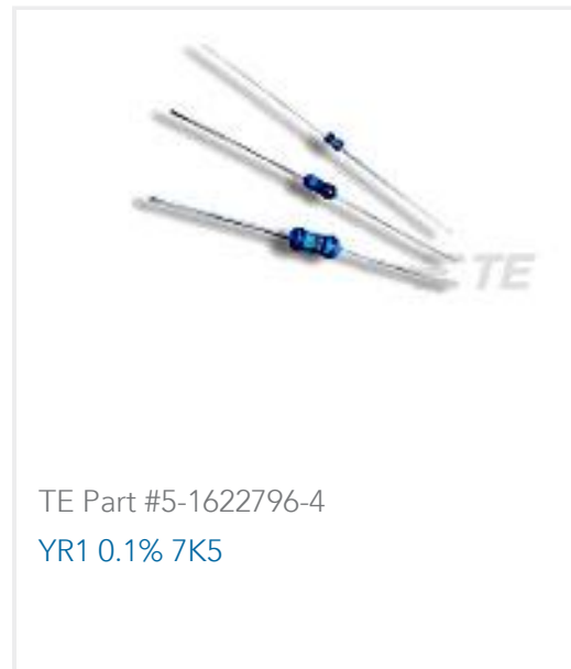
TE Part #5-1622796-4 YR1 0.1% 7K5