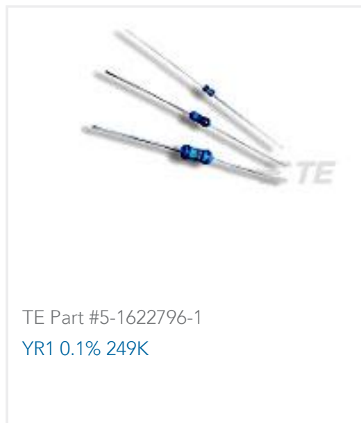
TE Part #5-1622796-1 YR1 0.1% 249K