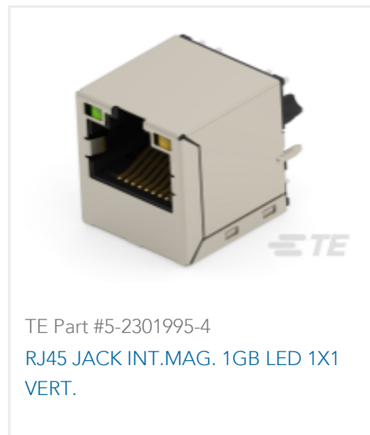
TE Part #5-2301995-4 RJ45 JACK INT.MAG. 1GB LED 1X1 VERT.