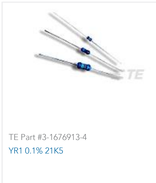
TE Part #3-1676913-4 YR1 0.1% 21K5