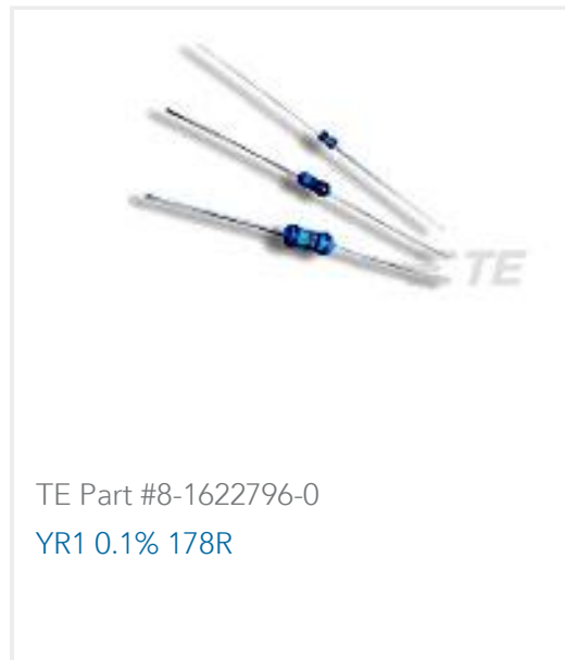
TE Part #8-1622796-0 YR1 0.1% 178R