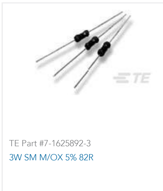
TE Part #7-1625892-3 3W SM M/OX 5% 82R