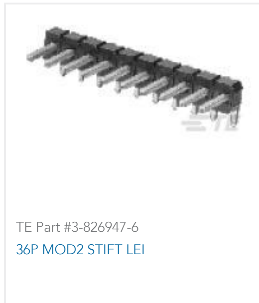
TE Part #3-826947-6 36P MOD2 STIFT LEI