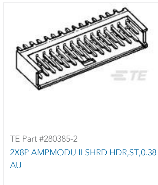
TE Part #280385-2 2X8P AMPMODU II SHRD HDR,ST,0.38 AU