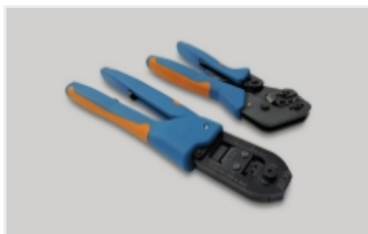
Hand Crimping Tools(4)