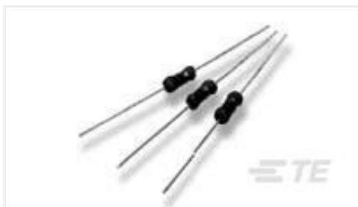
TE Part #3-1625892-9 3W SM M/OX 5% 2R2