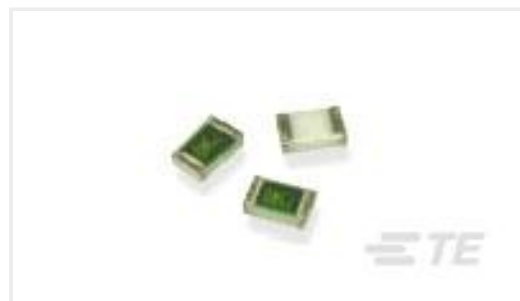
TE Part #3-2176093-3 RP 2A 0.25W 20K5 0.1% 25PPM 1K RL