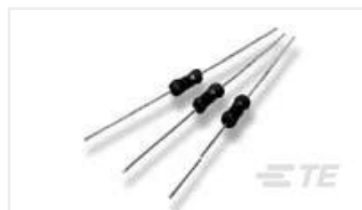
TE Part #5-1625890-8 2W SM M/OX 5% 560R