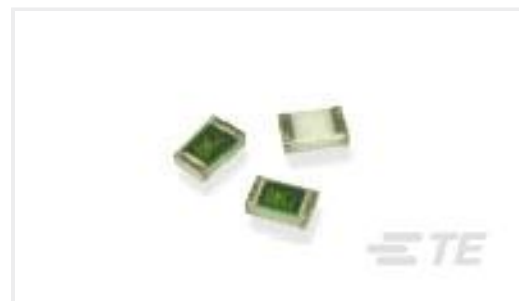
TE Part #1676250-2 RN 0805 20K 0.1% 10PPM 1KRL