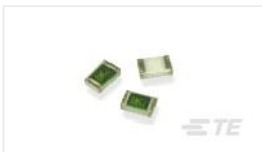
TE Part #1676282-3 RN 0805 2K0 0.1% 10PPM 5KRL