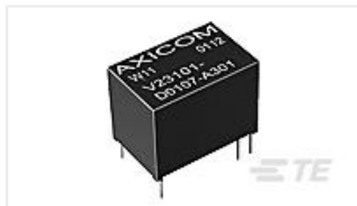
TE Part #4-1393779-0 V23101D1003B201