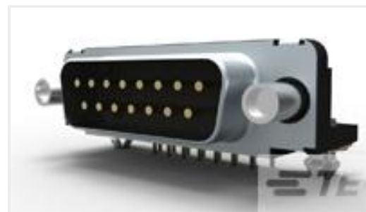
TE Part #5747841-6 15 MSFL PLUG RA 318 (SL,FM,BL)