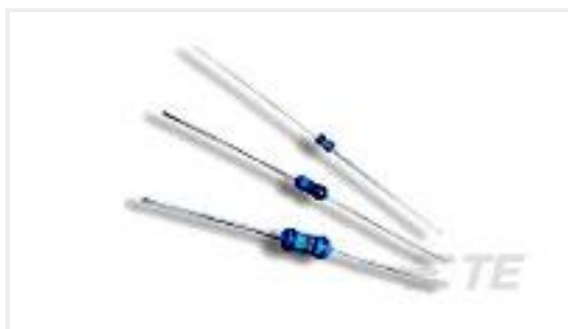
TE Part #1622342-2 LR1 1% 180R