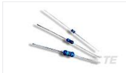
TE Part #1-1622297-5 LR1 1% 107K