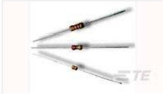
TE Part # 2-1623929-2 CFR200 5% 22K