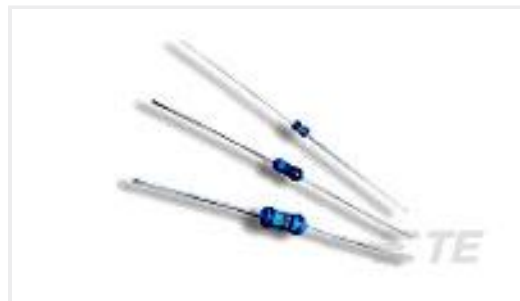
TE Part #1622341-1 LR1 1% 180K