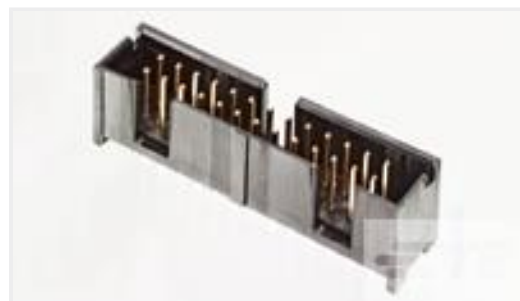
TE Part #5103308-6 A/L LOW PRO HDR 26P VERT BLACK