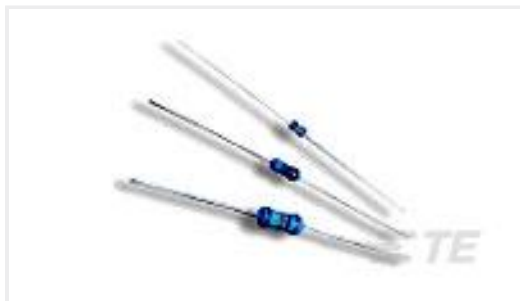
TE Part #1622467-5 LR1 1% 3M3