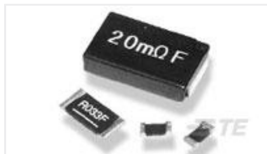
TE Part #3-1879378-2 TLR 2512 1.0W R003 1% 150PPM 2K RL