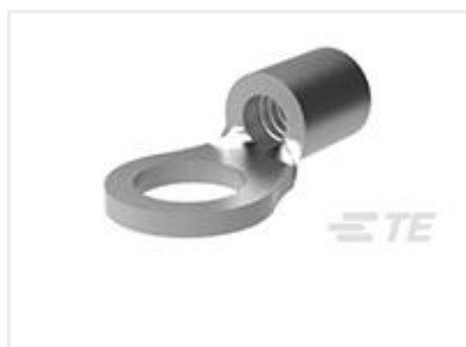
TE Part #34115 SOLIS R 22-16COMM 22-18MIL 3/8