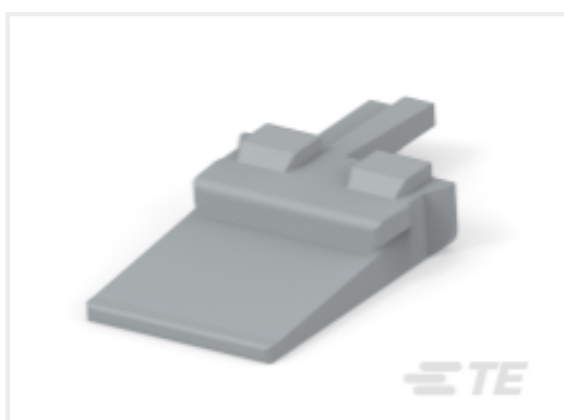
TE Part #W2PA WEDGE LOCK, 2P, REC, GRY, DT, A