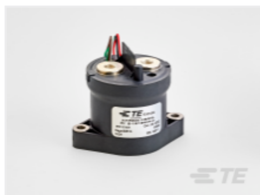
TE Part #5-1618404-0 KHR500KSANL=Contactor, SPST-NO