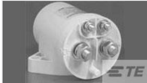
TE Part # 1618387-5 LEV200A4NAF=RELAY, SPST-NO