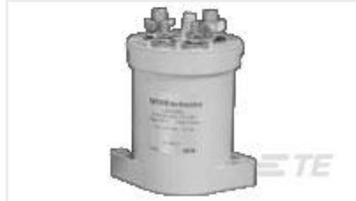
TE Part # 9-1618389-8 LEV100A5ANG=RELAY, SPST, 24Vdc