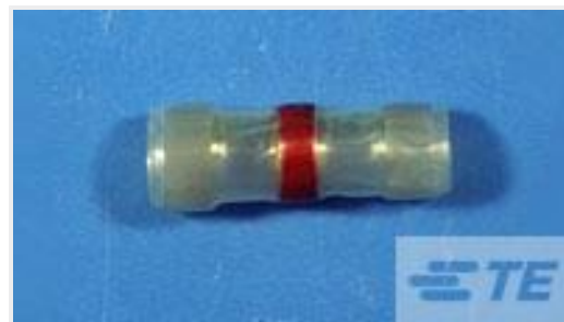
TE Part #448859-000 D-1744-01