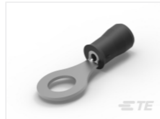
TE Part #CAT-P592-R472A PIDG Ring Tongue Terminals