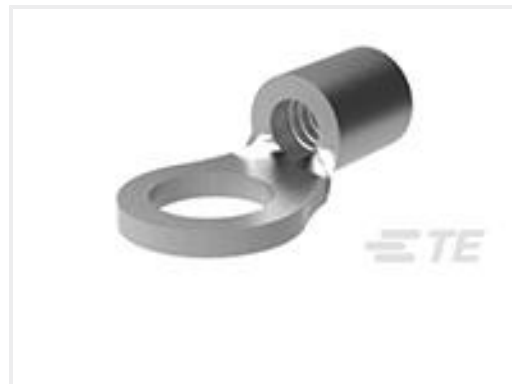
TE Part #34107-1 TERMINAL,SOLIS R 22-16 6