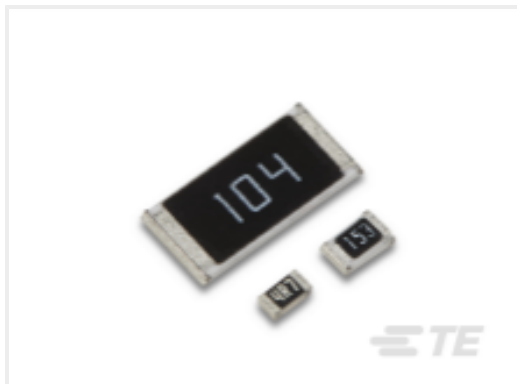
TE Part #4-2176339-1 CRGCQ 0603 22K 1%