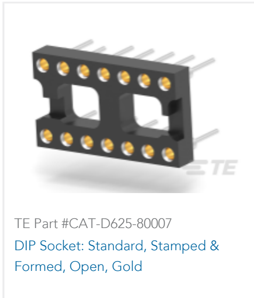
TE Part #CAT-D625-80007 DIP Socket: Standard, Stamped & Formed, Open, Gold