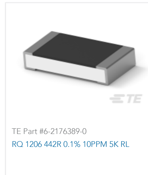
TE Part #6-2176389-0 RQ 1206 442R 0.1% 10PPM 5K RL