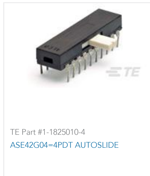
TE Part #1-1825010-4 ASE42G04=4PDT AUTOSLIDE