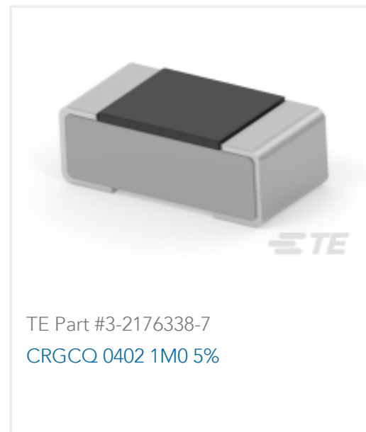
TE Part #3-2176338-7 CRGCQ 0402 1M0 5%