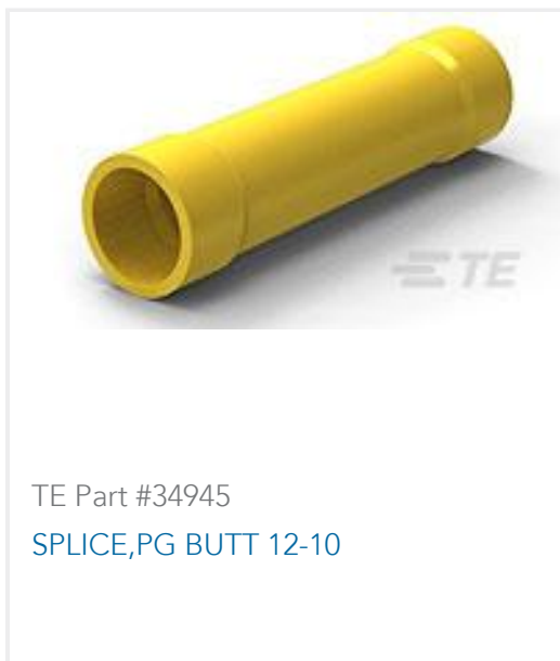
TE Part #34945 SPLICE,PG BUTT 12-10