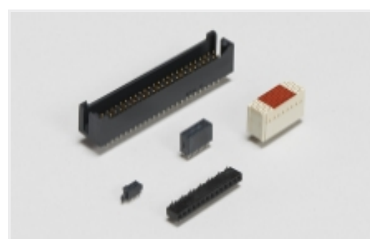
Board-to-Board Headers & Receptacles(1575)