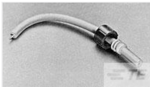
TE Part #2-839564-1 LEAD, SGL END ASSY, LGH