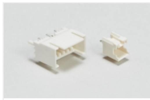
Wire-to-Board Headers & Receptacles (114)