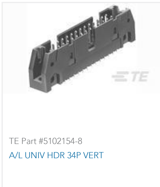
TE Part #5102154-8 A/L UNIV HDR 34P VERT