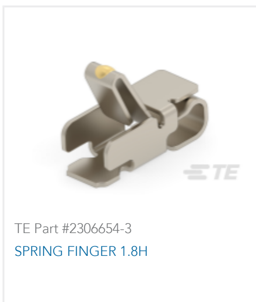
TE Part #2306654-3 SPRING FINGER 1.8H