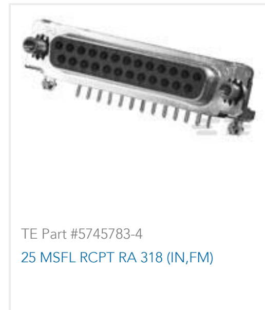
TE Part #5745783-4 25 MSFL RCPT RA 318 (IN,FM)