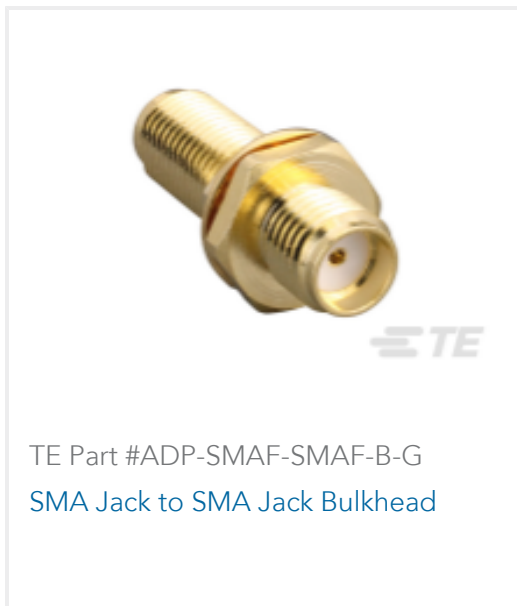
TE Part #ADP-SMAF-SMAF-B-G SMA Jack to SMA Jack Bulkhead