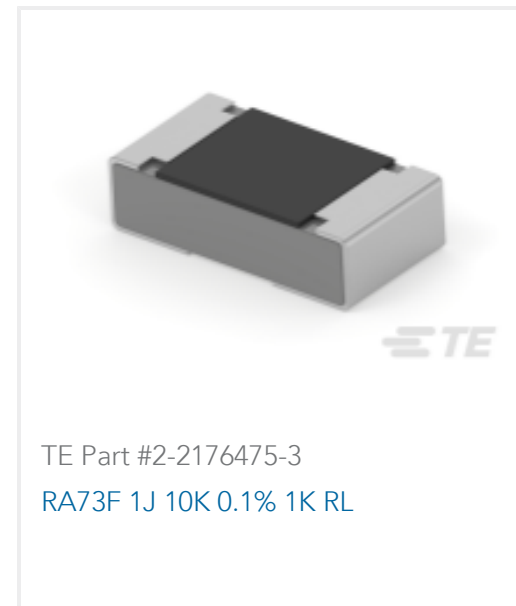
TE Part #2-2176475-3 RA73F 1J 10K 0.1% 1K RL