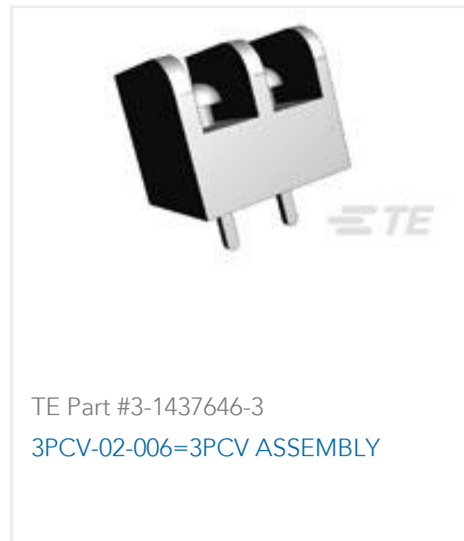
TE Part #3-1437646-3 3PCV-02-006=3PCV ASSEMBLY