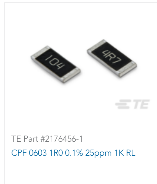
TE Part #2176456-1 CPF 0603 1R0 0.1% 25ppm 1K RL