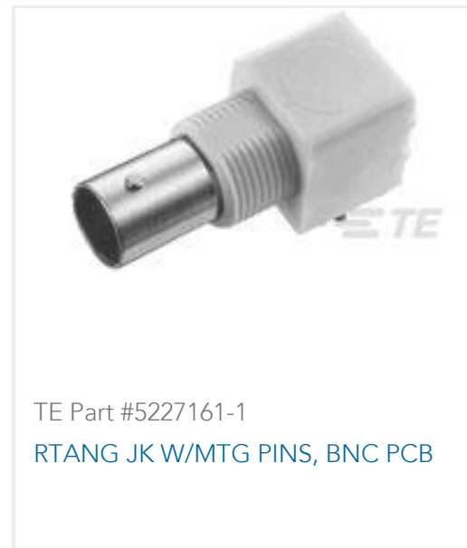
TE Part #5227161-1 RTANG JK W/MTG PINS, BNC PCB