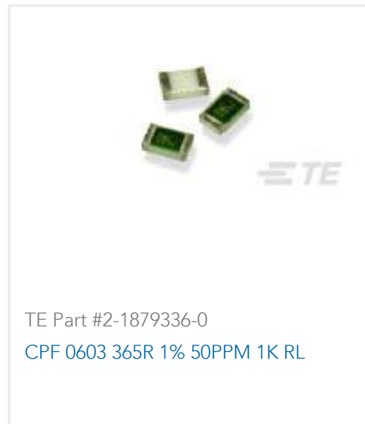
TE Part #2-1879336-0 CPF 0603 365R 1% 50PPM 1K RL