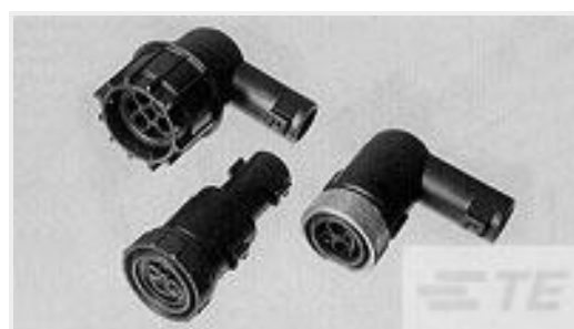
TE Part #100285-1 3P.4MM.SOCK.ASS.M24