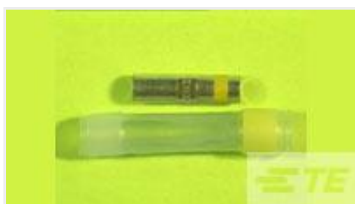
TE Part #650075-000 D-436-37