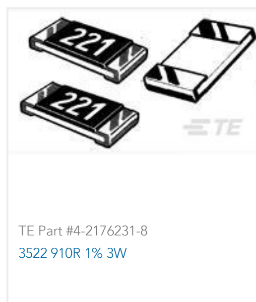
TE Part #4-2176231-8 3522 910R 1% 3W