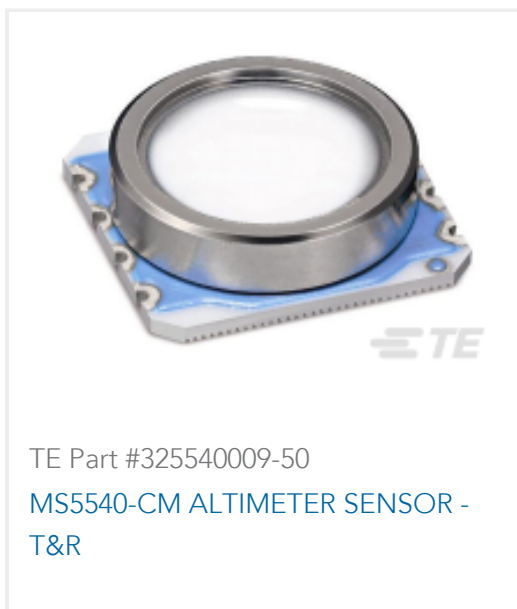
TE Part #325540009-50 MS5540-CM ALTIMETER SENSOR - T&R