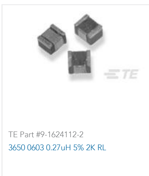
TE Part #9-1624112-2 3650 0603 0.27uH 5% 2K RL