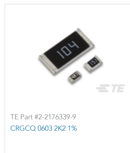
TE Part #2-2176339-9 CRGCQ 0603 2K2 1%