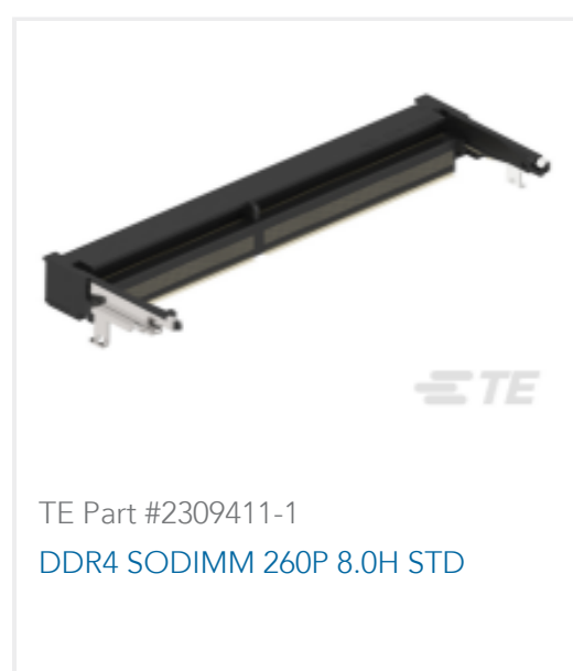
TE Part #2309411-1 DDR4 SODIMM 260P 8.0H STD