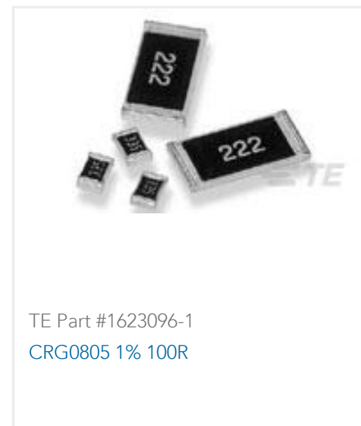
TE Part #1623096-1 CRG0805 1% 100R