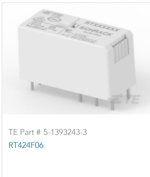
TE Part # 5-1393243-3 RT424F06