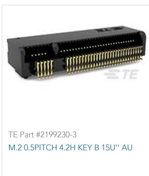
TE Part #2199230-3 M.2 0.5PITCH 4.2H KEY B 15U AU