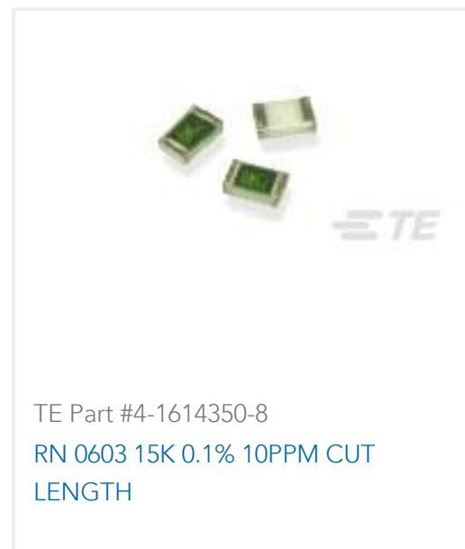
TE Part #4-1614350-8 RN 0603 15K 0.1% 10PPM CUT LENGTH