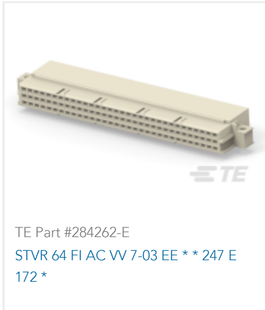
TE Part #284262-E STVR 64 FI AC VV 7-03 EE ** 247 E 172 *