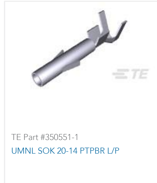
TE Part #350551-1 UMNL SOK 20-14 PTPBR L/P