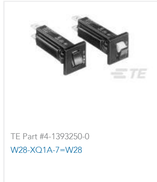
TE Part #4-1393250-0 W28-XQ1A-7=W28