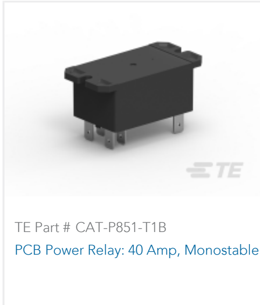
TE Part # CAT-P851-T1B PCB Power Relay: 40 Amp, Monostable