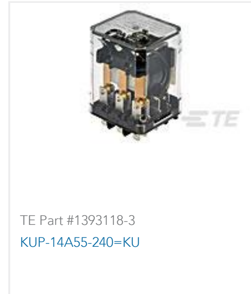
TE Part #1393118-3 KUP-14A55-240=KU