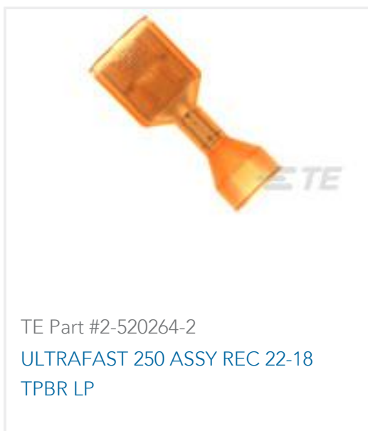
TE Part #2-520264-2 ULTRAFast 250 ASSY REC 22-18 TPBR LP