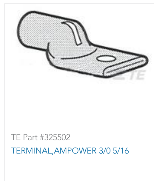
TE Part #325502 TERMINAL,AMPOWER 3/0 5/16