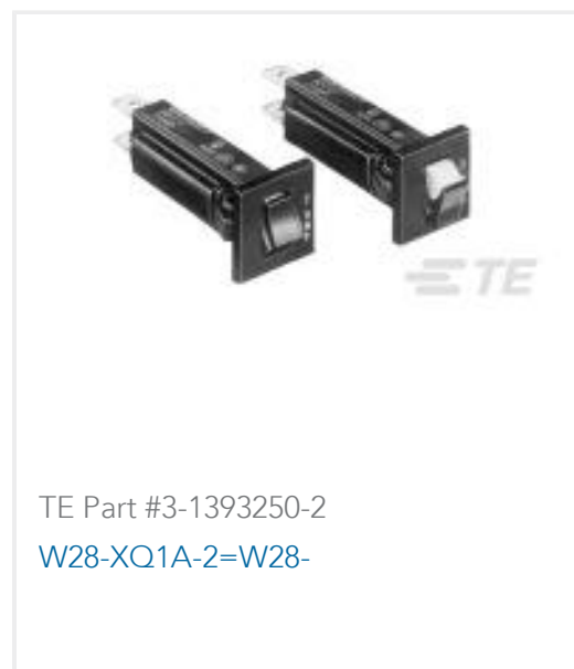
TE Part #3-1393250-2 W28-XQ1A-2=W28