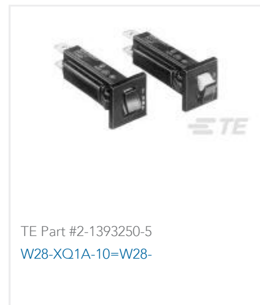
TE Part #2-1393250-5 W28-XQ1A-10=W28