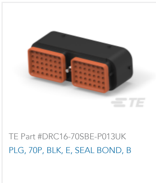
TE Part #DRC16-70SBE-P013UK PLG, 70P, BLK, E, SEAL BOND, B