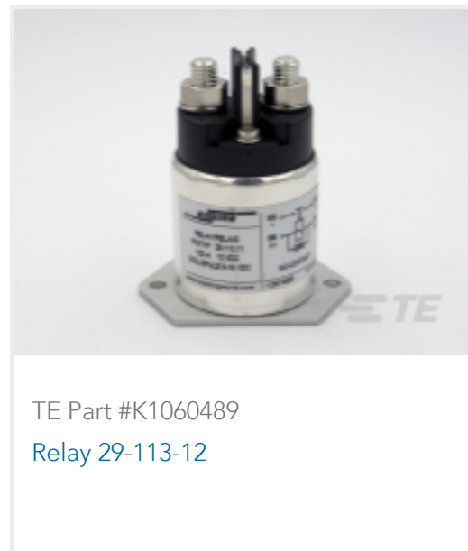
TE Part #K1060489 Relay 29-113-12