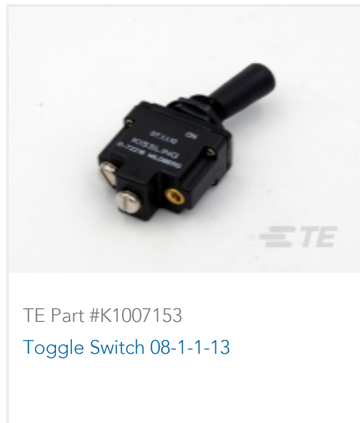
TE Part #K1007153 Toggle Switch 08-1-1-13