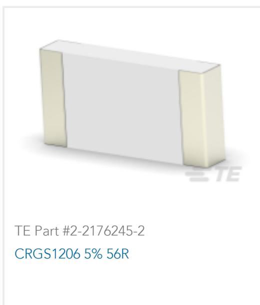
TE Part #2-2176245-2 CRGS1206 5% 56R