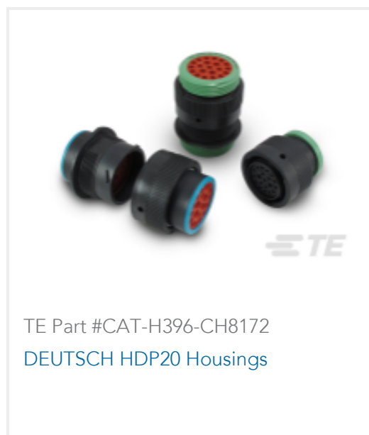
TE Part #CAT-H396-CH8172 DEUTSCH HDP20 Housings