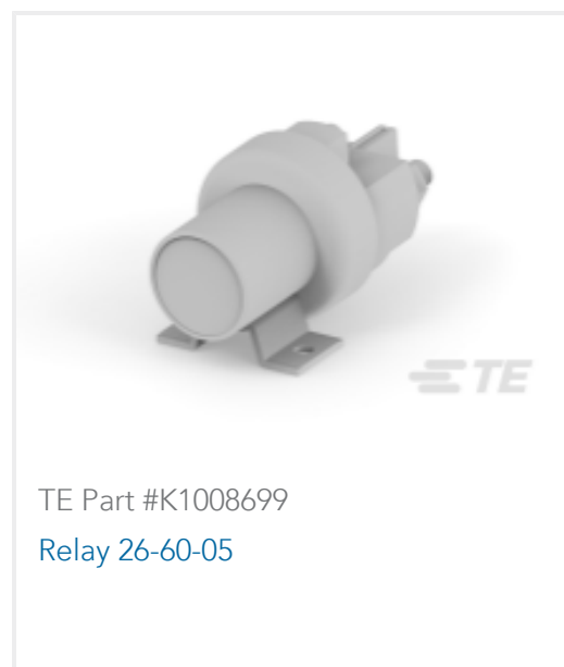
TE Part #K1008699 Relay 26-60-05