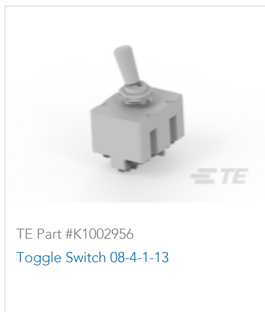
TE Part #K1002956 Toggle Switch 08-4-1-13