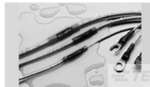
TE Part #967398-000 D-406-0001