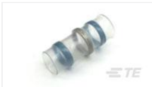
TE Part #114163-000 CWT-9003