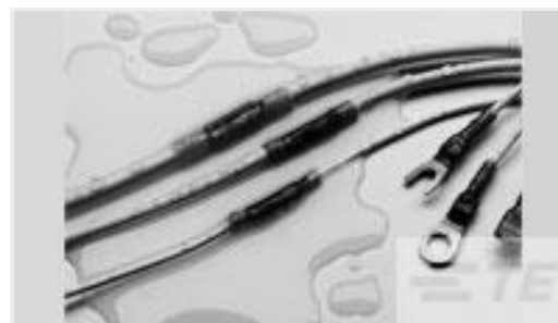
TE Part #454100-000 D-406-0002