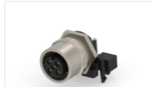
TE Part #T4145015041-001 M12 R/A F PNLREAR STAMPED PIN A- CODE 4P