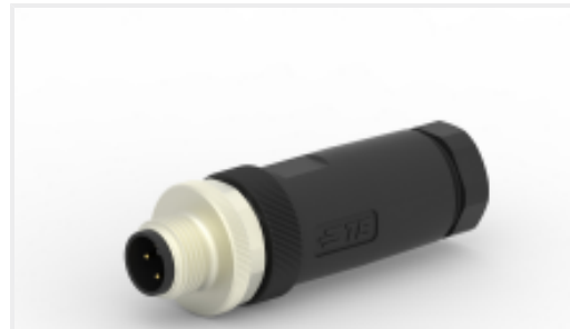
TE Part #T4111002041-000 M12,MALE,STRAIGHT,A CODE,4P, PG9,GOLD