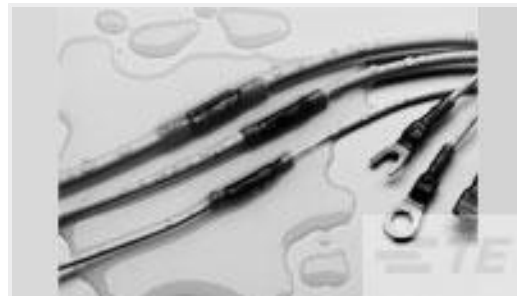
TE Part #108961-000 D-406-0003