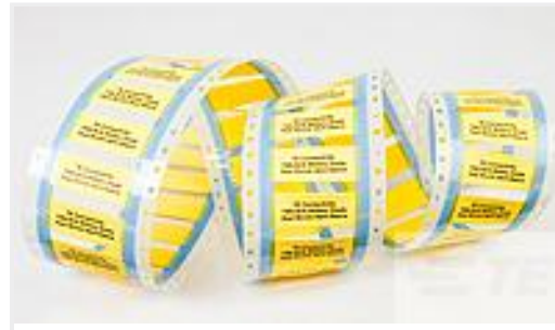
TE Part #877714-000 TMS-SCE-2X-3/32-9