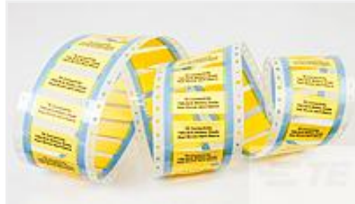
TE Part #251895-000 TMS-SCE-2X-1K-1/8-9