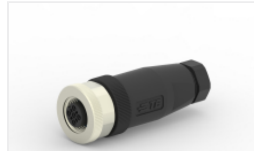
TE Part #T4110001031-000 M12,FEMALE,STRAIGHT,A CODE,3P, PG7,GOLD