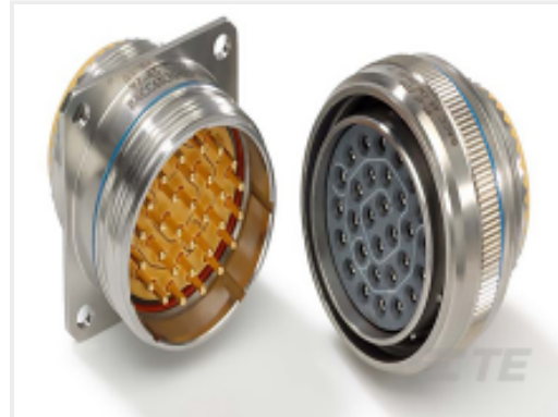
TE Part #ZPF000000000007606 983-0SE 16-24 PN