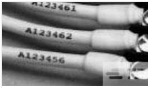
TE Part #5053284031 RNF-100-3/4-9-SP