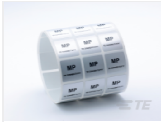
TE Part #CAT-T3437-M8791 MP Metalized Polyester Labels