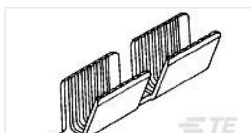
TE Part #62001-2 SPLICE AMVAR 3000-7000 020TPBR