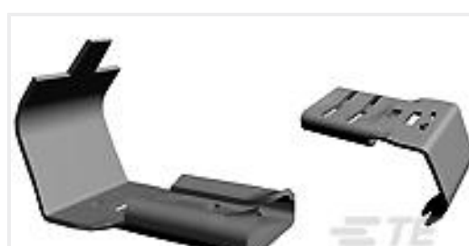
TE Part #61177-2 250 FASTON FLAG REC 18-12 AWG TPBR