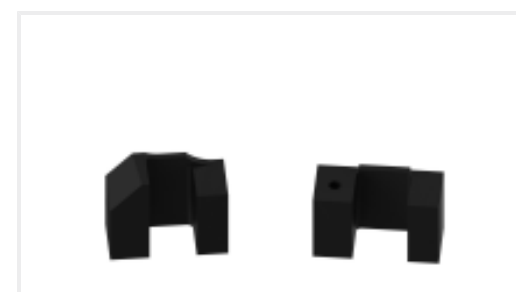
TE Part #937196-1 HOLDER, SHEAR FRONT