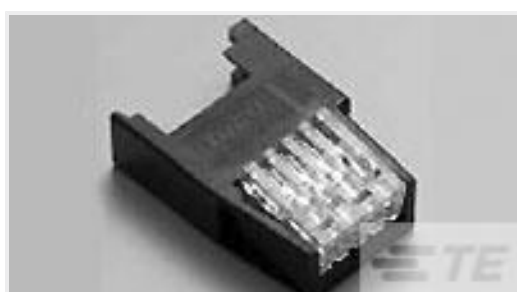
TE Part #1746741-4 RITS CONN. SOCKET ASSY 4P YELLOW