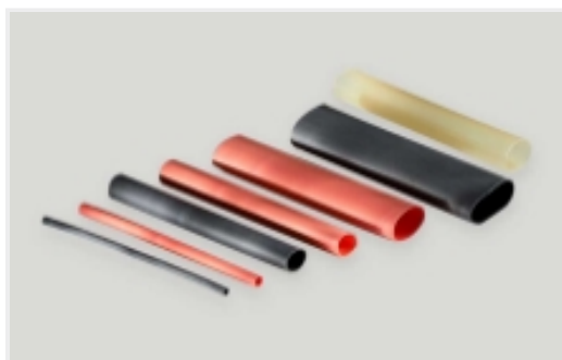
Dual Wall Tubing(1)