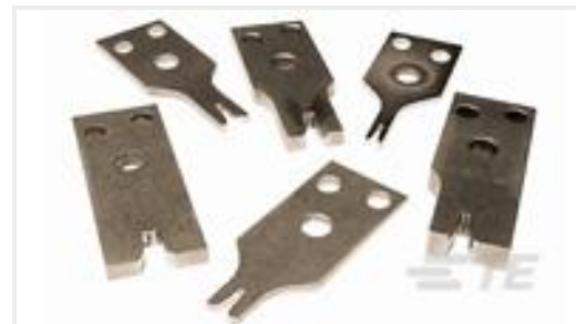
TE Part #1-456404-8 CRIMPER, WIRE .070 F