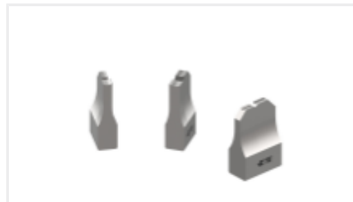
TE Part #7-1633620-6 ANVIL, COMBINATION