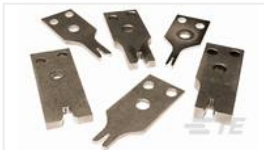
TE Part #1-2119582-0 Crimper, Insulation F Premium