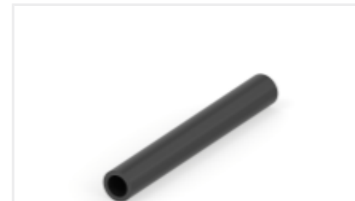
TE Part #CAT-HST-VERSAFITV4 Versafit-V4 Heat Shrink Tubing