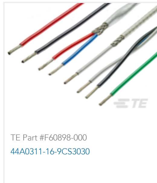
TE Part #F60898-000 44A0311-16-9CS3030