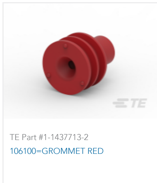
TE Part #1-1437713-2 106100=GROMMET RED