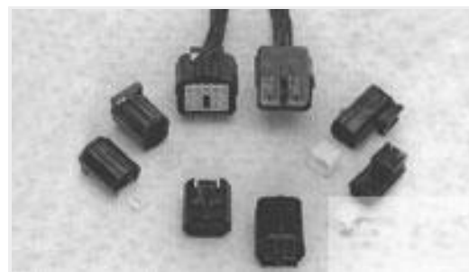
TE Part #344276-1 2 WAY REC HSG. SIL SEAL ECONO