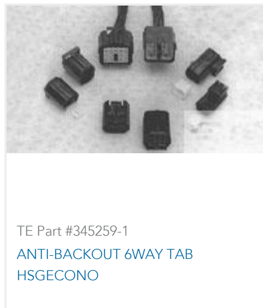
TE Part #345259-1 ANTI-BACKOUT 6WAY TAB HSGECONO