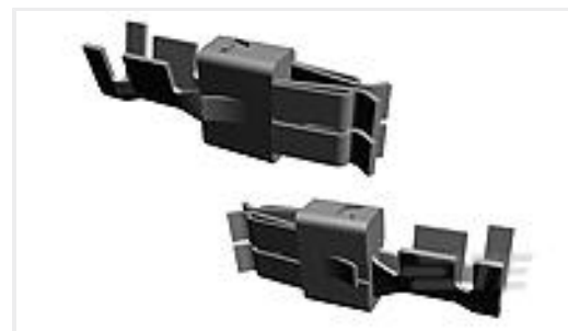
TE Part #927837-1 SPT REC 6.3 Contact SRC Sn