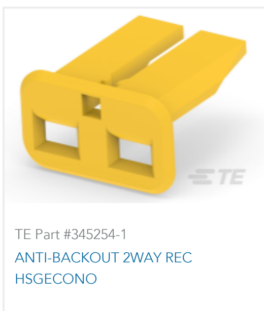
TE Part #345254-1 ANTI-BACKOUT 2WAY REC HSGECONO