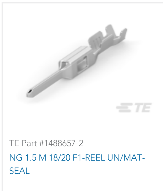
TE Part #1488657-2 NG 1.5 M 18/20 F1-REEL UN/MAT- SEAL