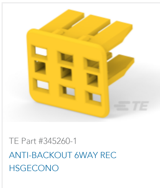
TE Part #345260-1 ANTI-BACKOUT 6WAY REC HSGECONO