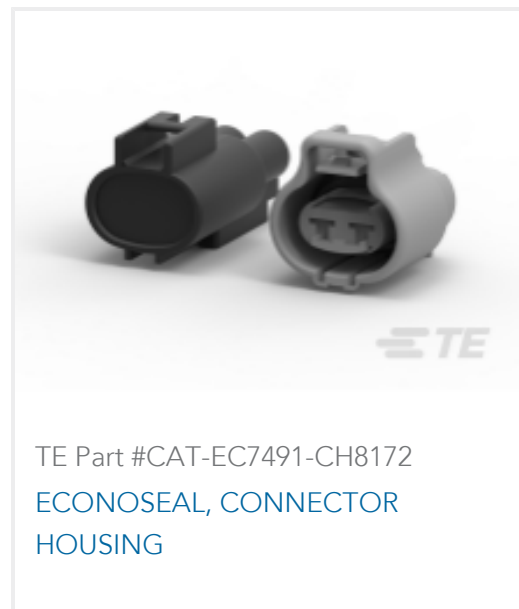
TE Part #CAT-EC7491-CH8172 ECONOSEAL, CONNECTOR HOUSING