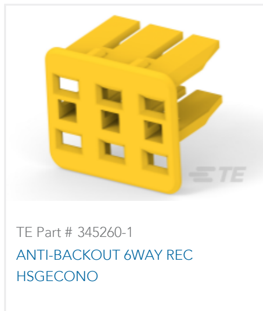
TE Part # 345260-1 ANTI-BACKOUT 6WAY REC HSGECONO