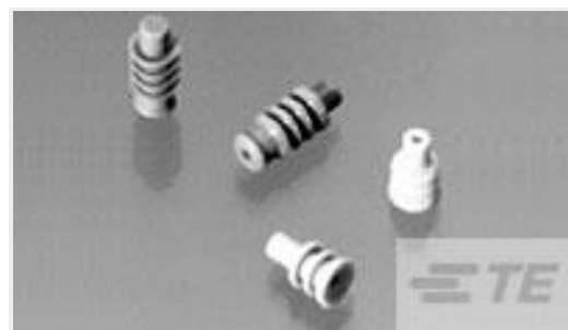
TE Part #347874-1 CABLE SEAL LC SILICON 0.5 T