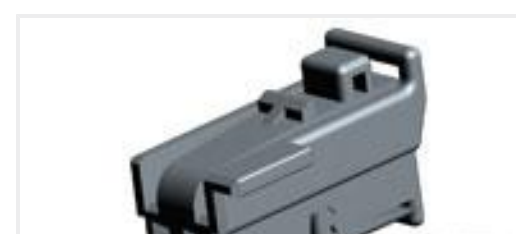
TE Part #1-929080-5 2POS MQS REC COD A