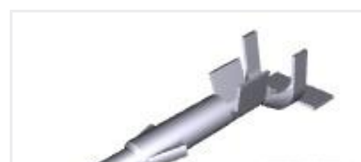
TE Part #926900-3 UNIV-MNL STIFT