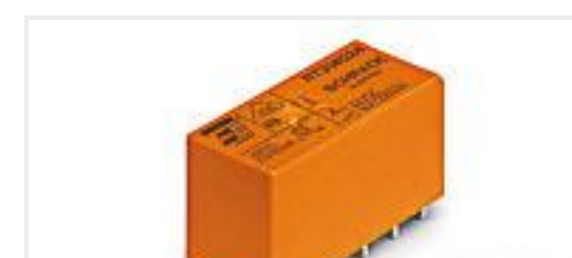
TE Part #8-1415006-1 RTH14012