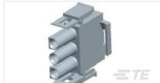
TE Part #1241809-2 UMNL ST-SOCK,A-P 3P