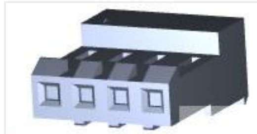
TE Part #3-640428-4 04P MTA156 CONN ASSY 22AWG RED