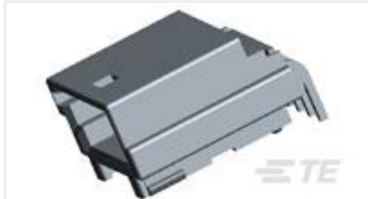
TE Part #1-1355897-1 4P,TAB0.63X0.63,HDR,90DEG,SLDR, COD A