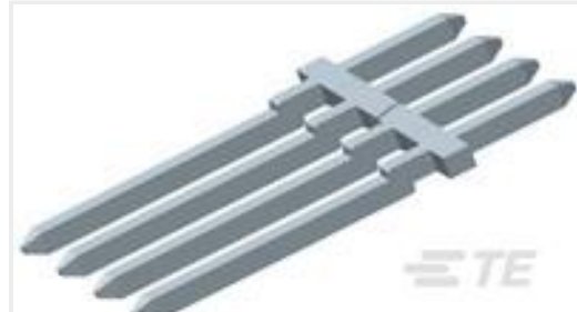
TE Part #1740205-2 AMPMODU II CONTACT PIN, BENT, TIN