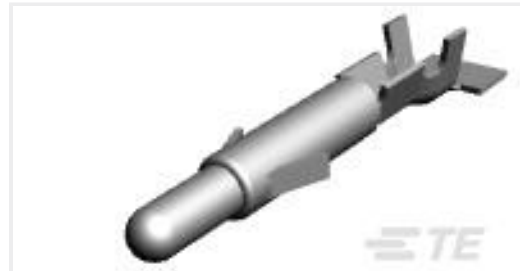
TE Part #926886-3 UNIV.M-N-L.PIN