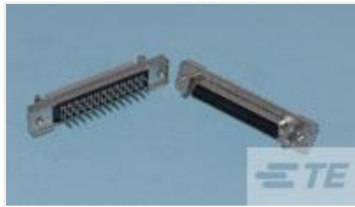
TE Part #786554-9 100 50SR VRT RCPT,L,R,ACT PIN