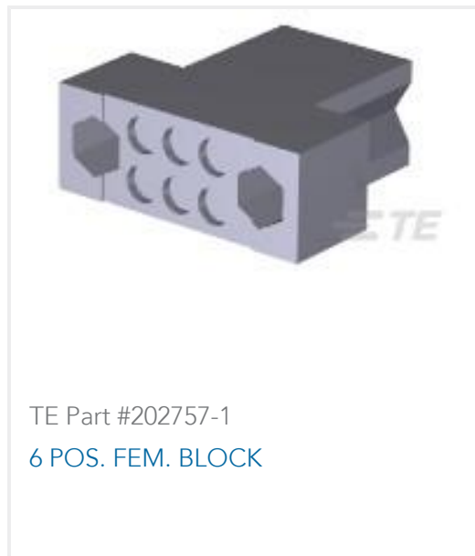
TE Part #202757-1 6 POS. FEM. BLOCK