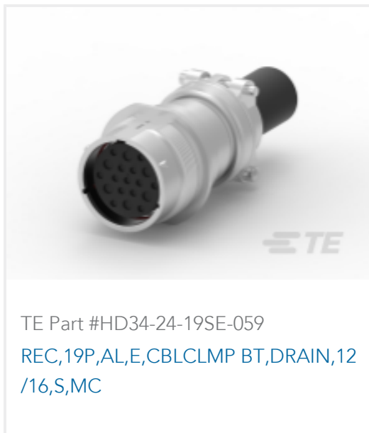
TE Part #HD34-24-19SE-059 REC,19P,AL,E,CBLCLMP BT,DRAIN,12 /16,S,MC