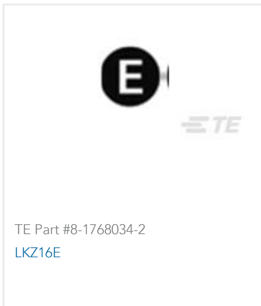
TE Part #8-1768034-2 LKZ16E