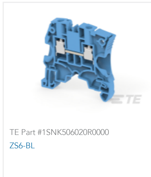
TE Part #1SNK506020R0000 ZS6-BL