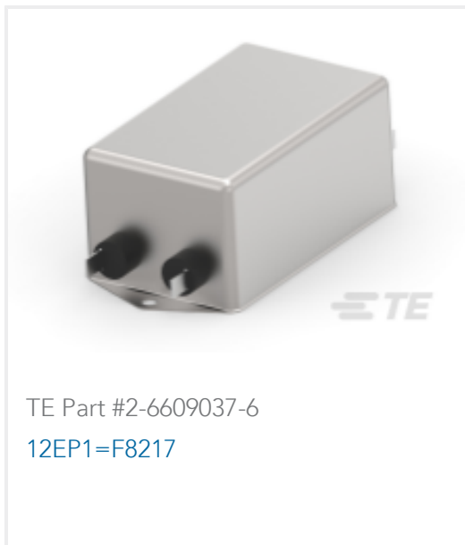
TE Part #2-6609037-6 12EP1=F8217