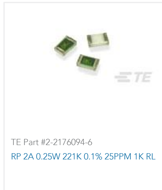
TE Part #2-2176094-6 RP 2A 0.25W 221K 0.1% 25PPM 1K RL