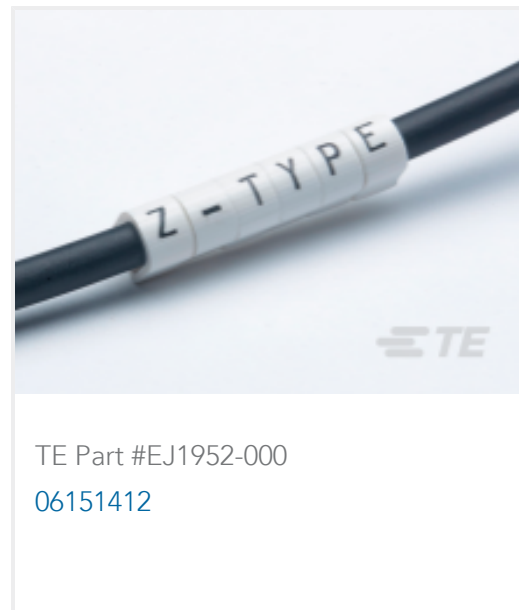
TE Part #EJ1952-000 06151412