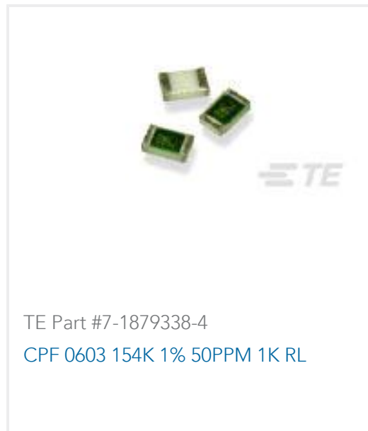
TE Part #7-1879338-4 CPF 0603 154K 1% 50PPM 1K RL