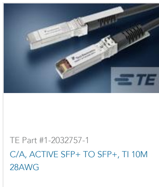
TE Part #1-2032757-1 C/A, ACTIVE SFP+ TO SFP+, TI 10M 28AWG