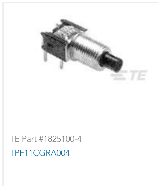
TE Part #1825100-4 TPF11CGRA004