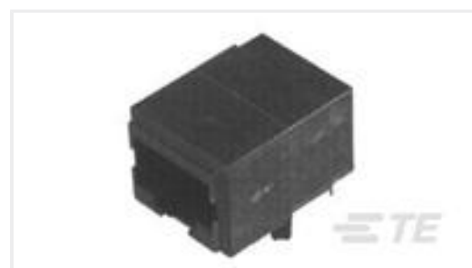
TE Part #5557785-1 MJ,8POS,R/A,LPF