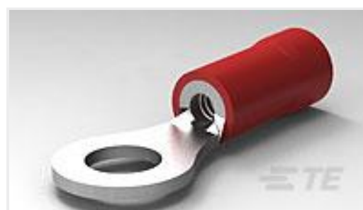
TE Part #34148 PG R 22-16 COMM 22-18 MIL 8