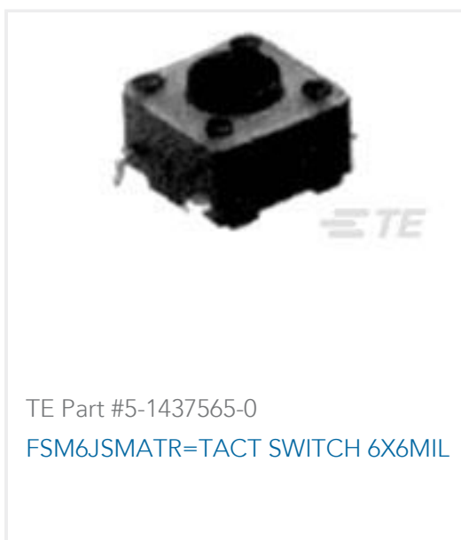
TE Part #5-1437565-0 FSM6JSMATR=TACT SWITCH 6X6MIL