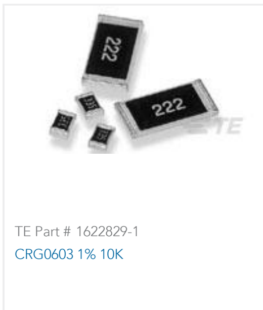
TE Part # 1622829-1 CRG0603 1% 10K