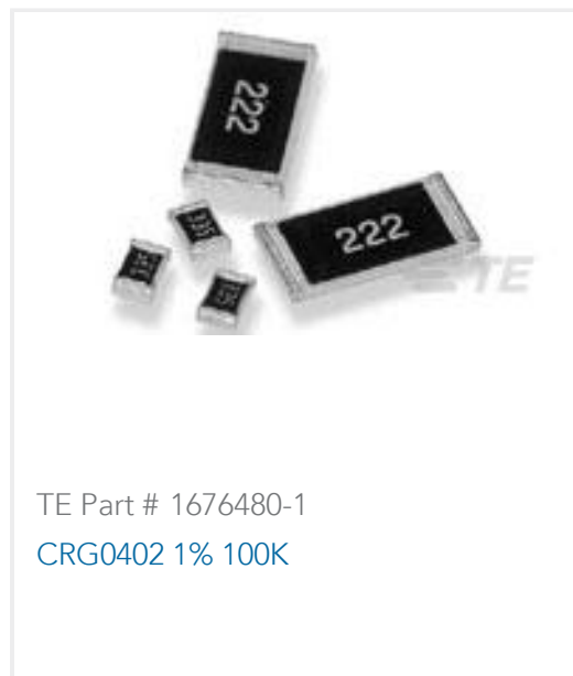
TE Part # 1676480-1 CRG0402 1% 100K