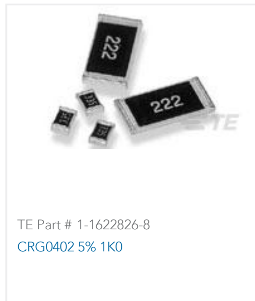
TE Part # 1-1622826-8 CRG0402 5% 1K0