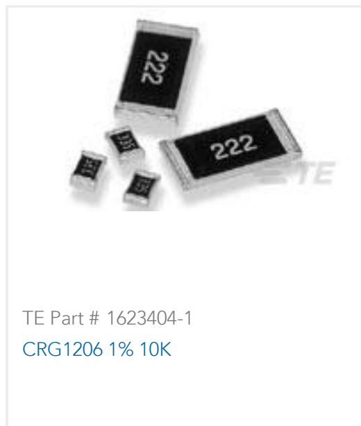
TE Part # 1623404-1 CRG1206 1% 10K