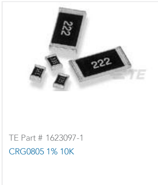
TE Part # 1623097-1 CRG0805 1% 10K