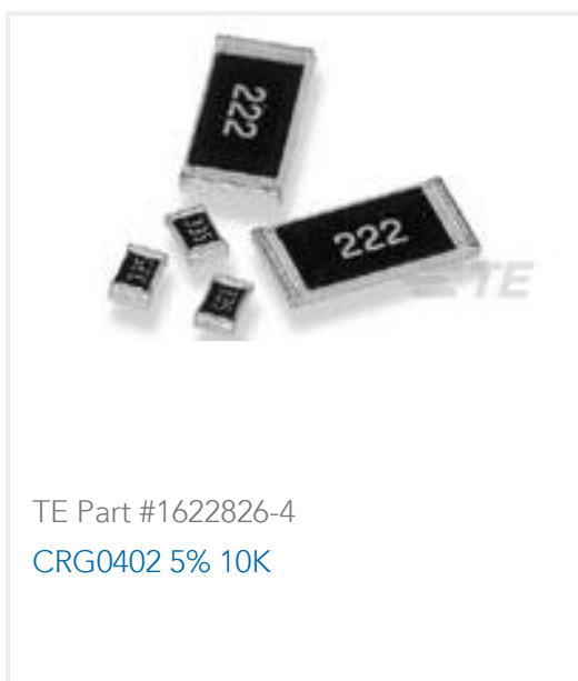
TE Part #1622826-4 CRG0402 5% 10K