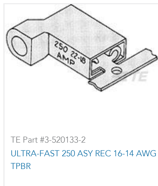
TE Part #3-520133-2 ULTRA-FAST 250 ASY REC 16-14 AWG TPBR