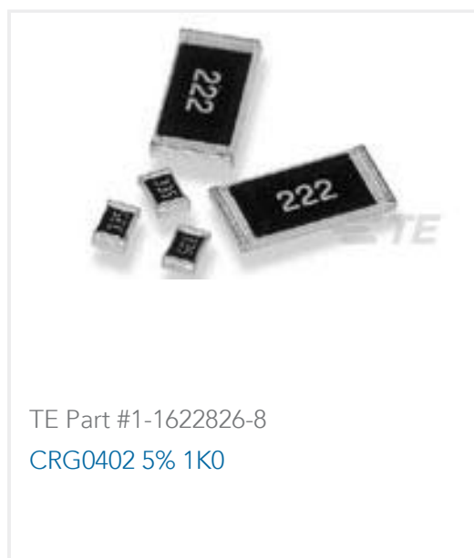
TE Part #1-1622826-8 CRG0402 5% 1K0