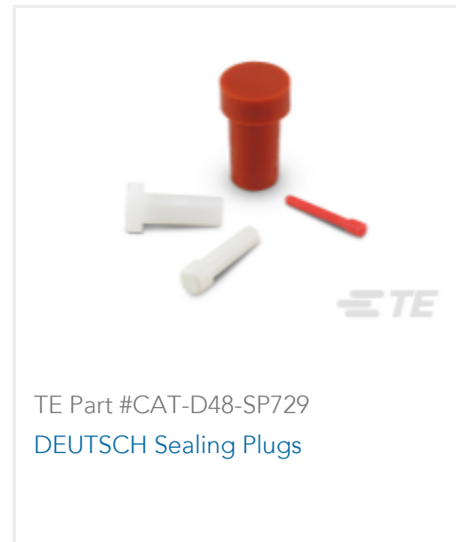
TE Part #CAT-D48-SP729 DEUTSCH Sealing Plugs