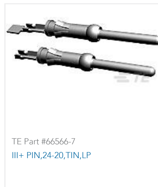
TE Part #66566-7 III+ PIN,24-20,TIN,LP