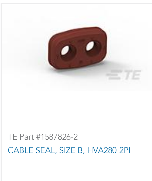
TE Part #1587826-2 CABLE SEAL, SIZE B, HVA280-2PI