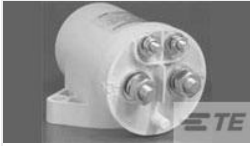
TE Part # 1618387-5 LEV200A4NAF=RELAY, SPST-NO