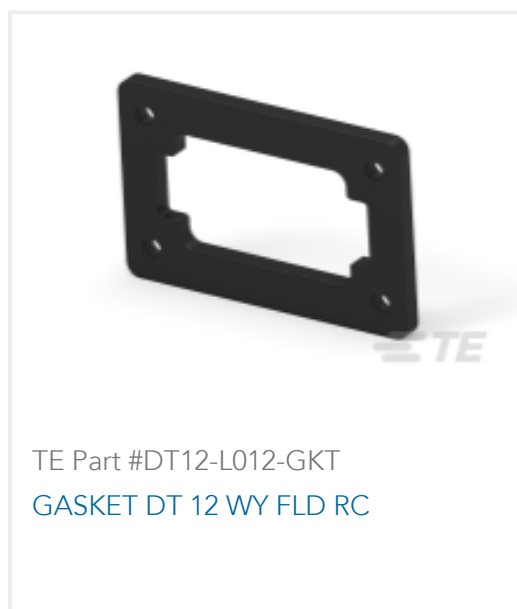
TE Part #DT12-L012-GKT GASKET DT 12 WY FLD RC