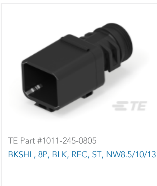
TE Part #1011-245-0805 BKSHL, 8P, BLK, REC, ST, NW8.5/10/13