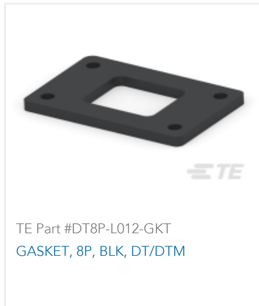
TE Part #DT8P-L012-GKT GASKET, 8P, BLK, DT/DTM