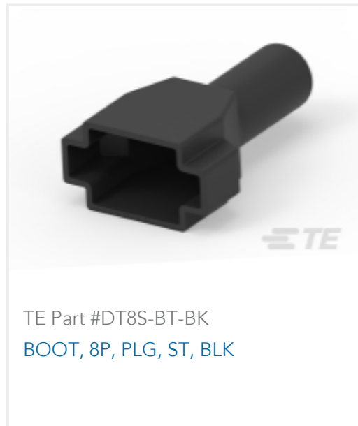
TE Part #DT8S-BT-BK BOOT, 8P, PLG, ST, BLK