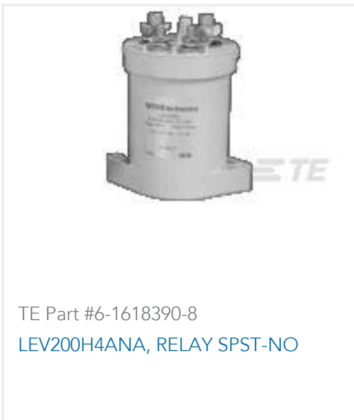
TE Part #6-1618390-8 LEV200H4ANA, RELAY SPST-NO