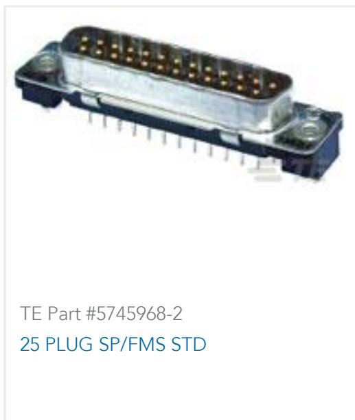
TE Part #5745968-2 25 PLUG SP/FMS STD