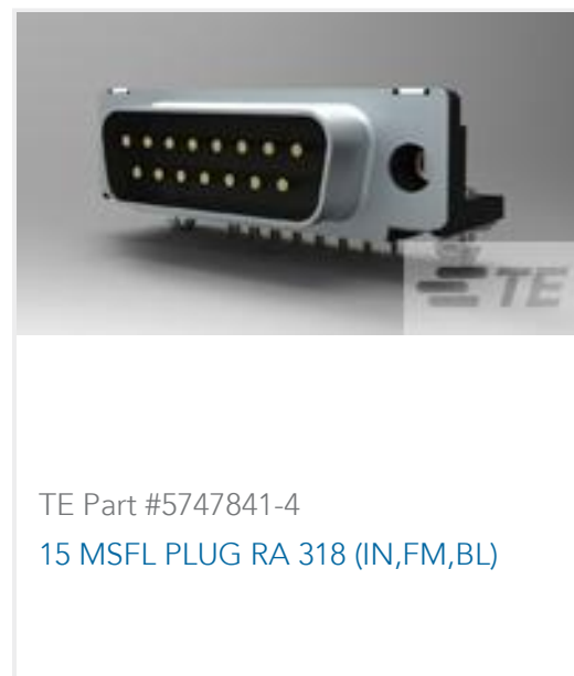
TE Part #5747841-4 15 MSFL PLUG RA 318 (IN,FM,BL)