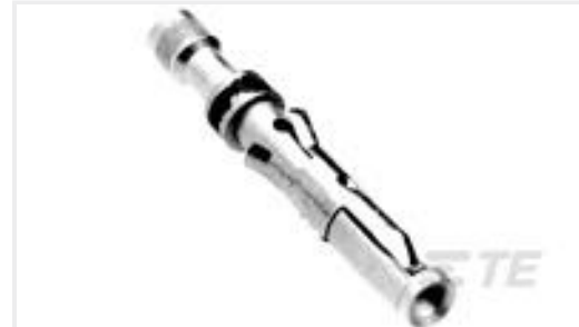
TE Part #201328-1 CONTACT SOCKET ASSY.