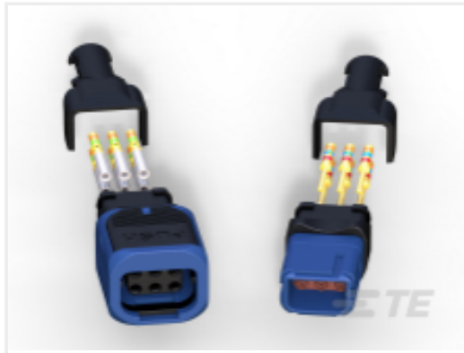
TE Part #D369-P66-AS1 369 6 WAY PLUG, CRIMP, SKT