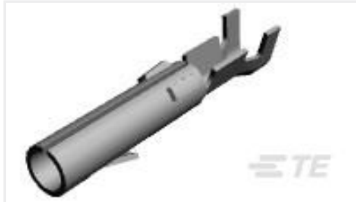
TE Part #60617-4 CMNL SOK PTPPHBZ L/P