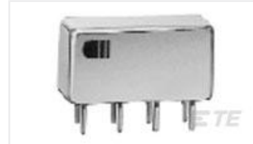
TE Part #2-1617038-8 HMB1230K01P = M39016/22-005P