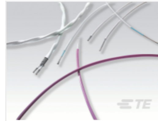
TE Part #CAT-NEMA-M27500-SD NEMA WC27500: ETFE Normal Weight Cables