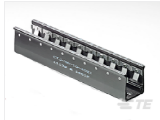
TE Part #CTJ-3D-05 RAIL ASSY