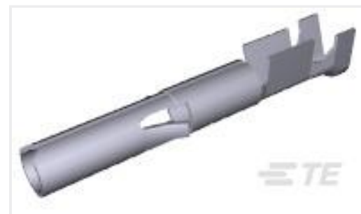
TE Part #350689-1 UMNL SOK 24-18 PTPBR L/P