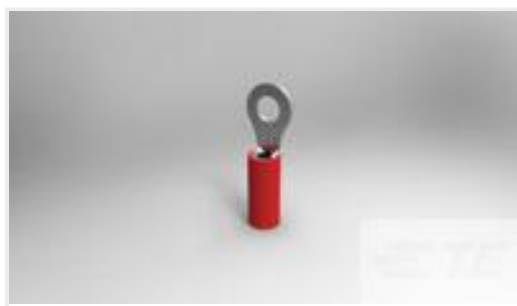
TE Part #51863 TERM, R, PIDG, 22-16/22-18, #6(M3.5)