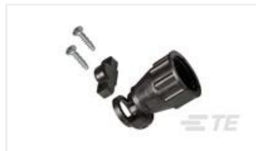
TE Part #1-206062-6 CABLE CLAMP KIT #11