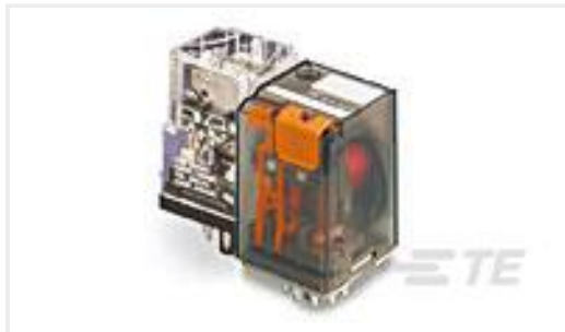
TE Part #1393105-3 KRPA-5DG-12=KRPA