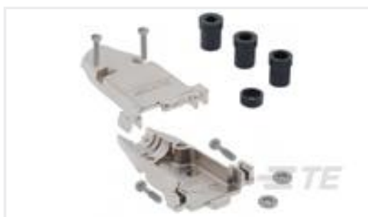
TE Part #5748676-1 DIE CAST CBL CLMP KIT,SZ 1