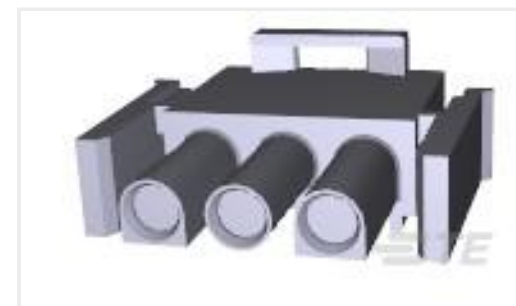
TE Part #350766-1 03P UMNL PLUG HSG