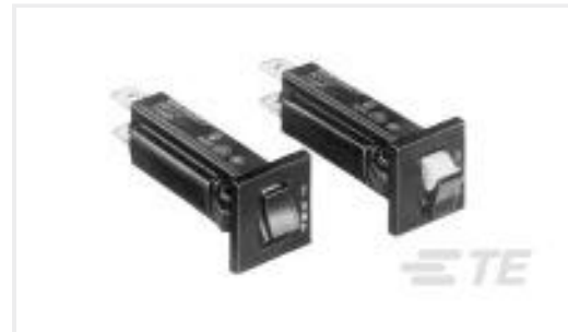
TE Part #2-1393250-1 W28-XQ1A-0.50=W28