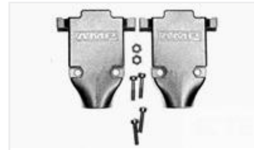
TE Part #5745174-5 CABLE CLAMP KIT,SZ 4