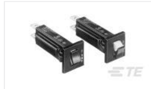
TE Part #3-1393250-8 W28-XQ1A-5=W28-