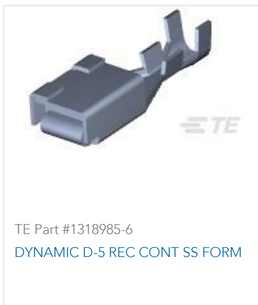
TE Part #1318985-6 DYNAMIC D-5 REC CONT SS FORM