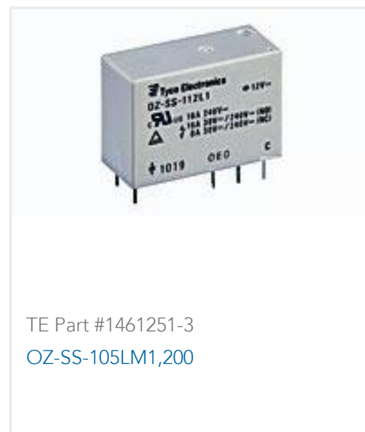
TE Part #1461251-3 OZ-SS-105LM1,200