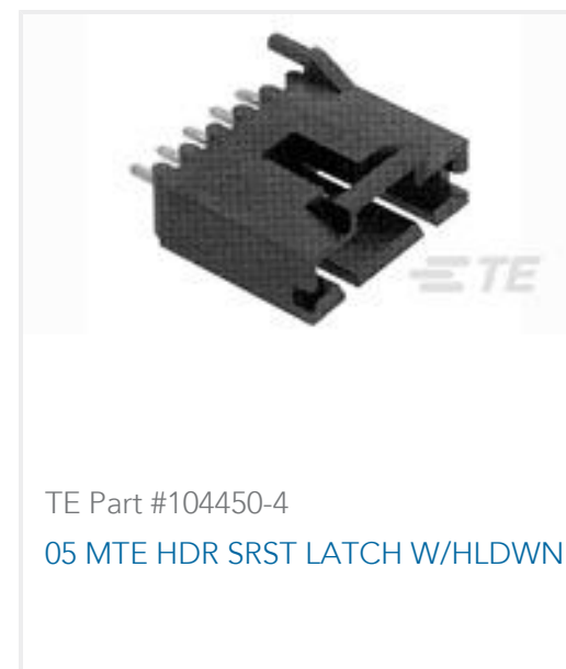
TE Part #104450-4 05 MTE HDR SRST LATCH W/HLDWN