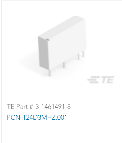
TE Part # 3-1461491-8 PCN-124D3MHZ,001