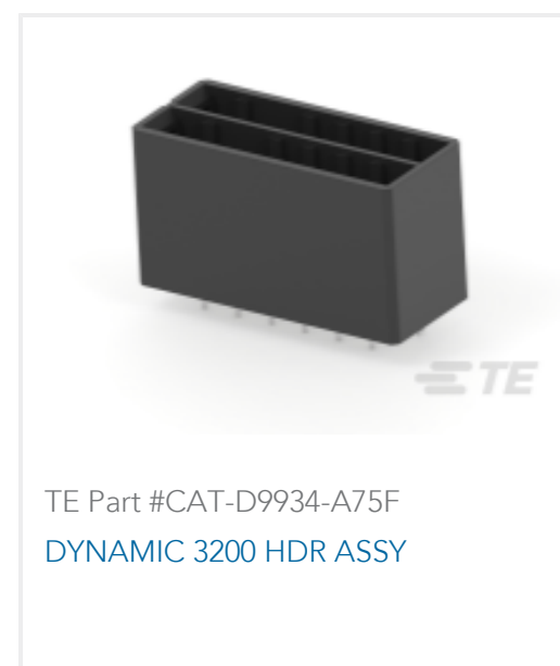
TE Part #CAT-D9934-A75F DYNAMIC 3200 HDR ASSY