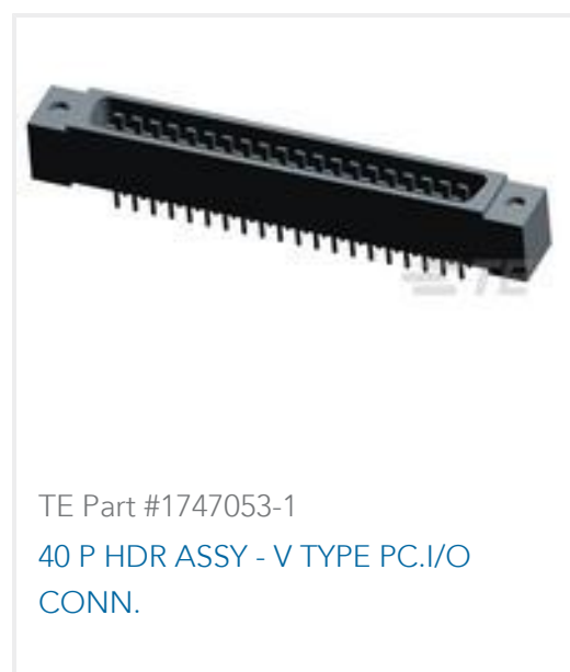
TE Part #1747053-1 40 P HDR ASSY - V TYPE PC.I/O CONN.