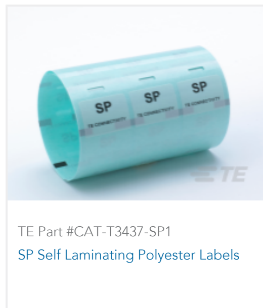
TE Part #CAT-T3437-SP1 SP Self Laminating Polyester Labels