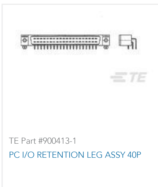
TE Part #900413-1 PC I/O RETENTION LEG ASSY 40P