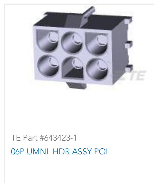
TE Part #643423-1 06P UMNL HDR ASSY POL