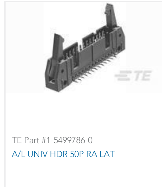
TE Part #1-5499786-0 A/L UNIV HDR 50P RA LAT