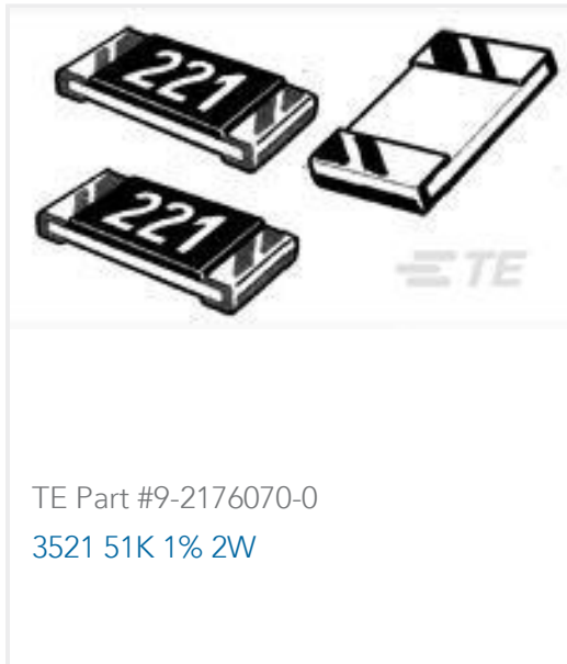
TE Part #9-2176070-0 3521 51K 1% 2W