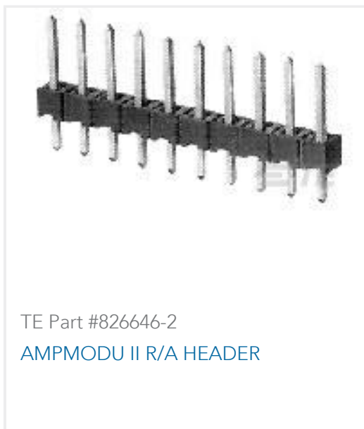
TE Part #826646-2 AMPMODU II R/A HEADER