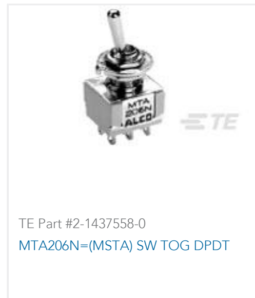
TE Part #2-1437558-0 MTA206N=(MSTA) SW TOG DPDT