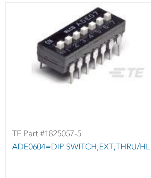
TE Part #1825057-5 ADE0604=DIP SWITCH,EXT,THRU/HL