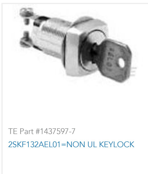
TE Part #1437597-7 2SKF132AEL01=NON UL KEYLOCK