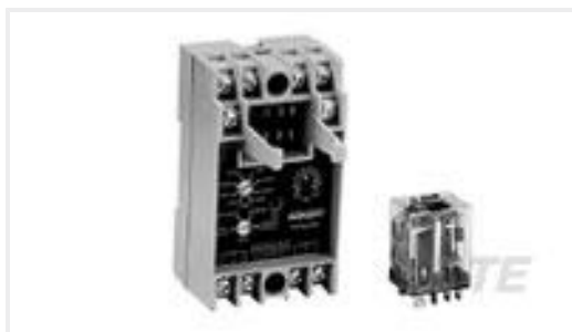
TE Part #1423167-3 SSFR90B=UNIV. TIMER 240V