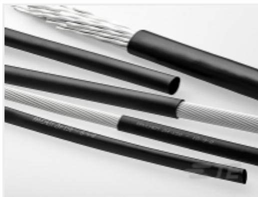
TE Part #EH3261-000 ZH150-3/1.5-0-SP