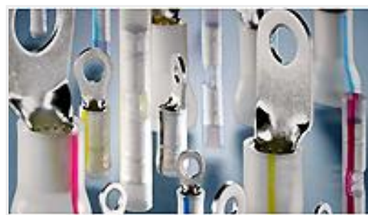
TE Part #53428-1 TERMINAL,PIDG PVF2 R 12-10 3/8