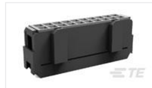
TE Part #1658624-9 40 NOVO DUAL 30DP, LEAD FREE