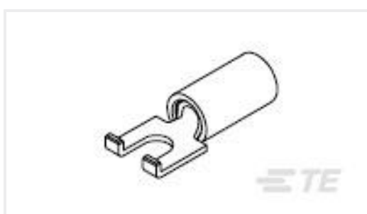
TE Part #8-320749-1 SOLIS SPDFLG 22-16COM22-18MIL6