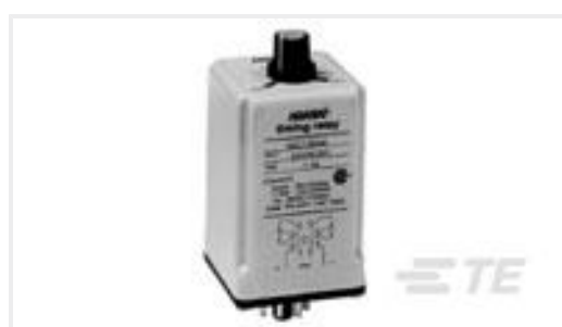
TE Part #2-1437471-4 SSC12BPA=240V 50 60HZ .1TO10SE