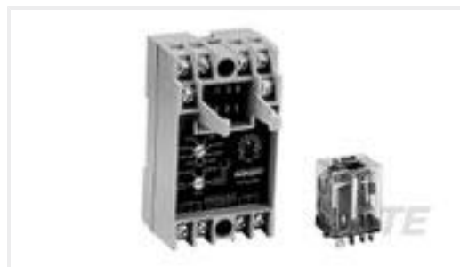
TE Part #1423167-4 SSFR90N=48V UNIVERSAL TIMER