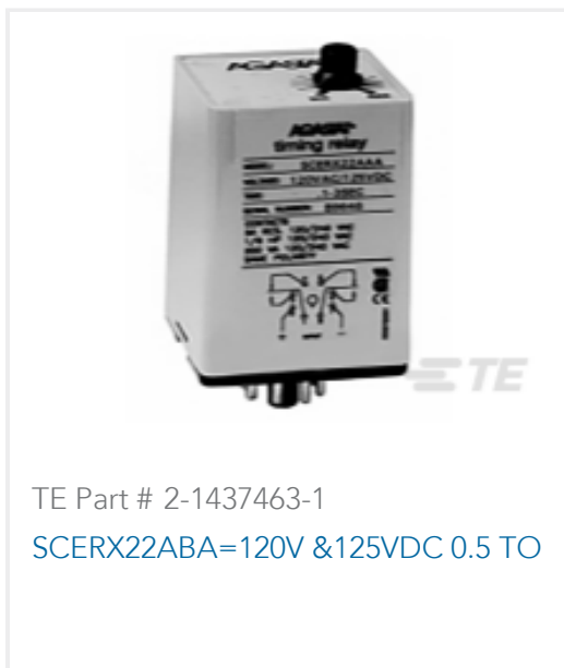
TE Part # 2-1437463-1 SCERX22ABA=120V & 125VDC 0.5 TO