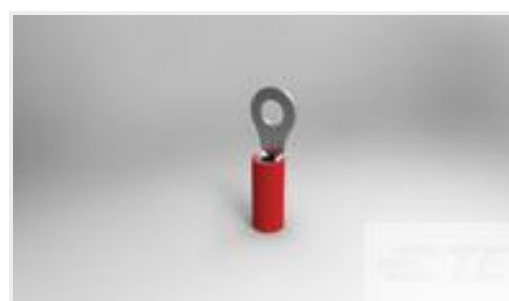
TE Part #51863-1 PIDG R 22-16 COMM 22-18 MIL 6