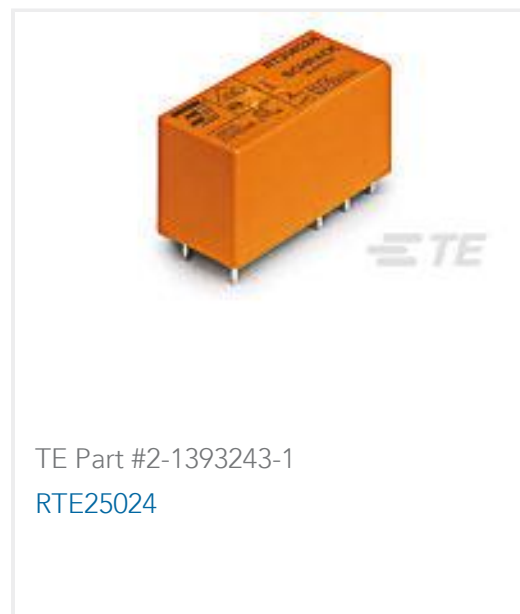
TE Part #2-1393243-1 RTE25024