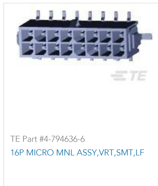
TE Part #4-794636-6 16P MICRO MNL ASSY,VRT,SMT,LF