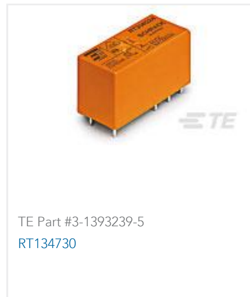
TE Part #3-1393239-5 RT134730