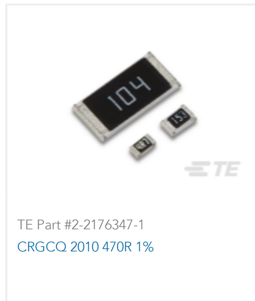
TE Part #2-2176347-1 CRGCO 2010 470R 1%