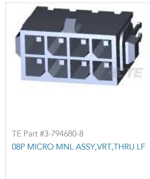
TE Part #3-794680-8 08P MICRO MNL ASSY,VRT,THRU LF