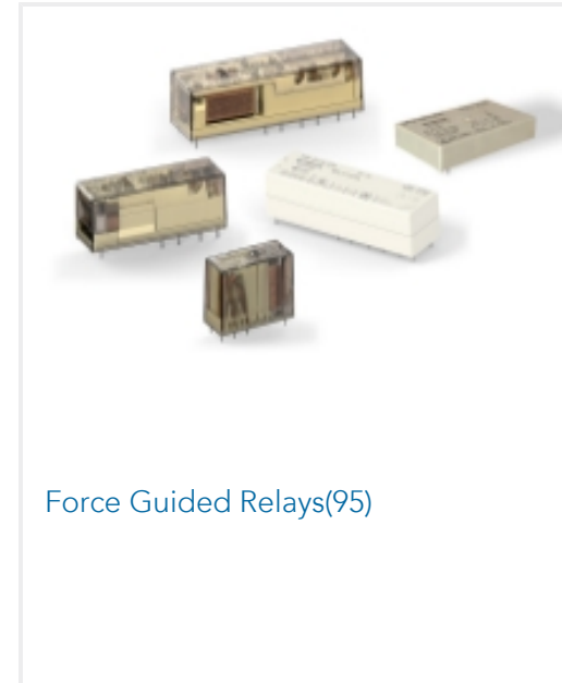
Force Guided Relays(95)