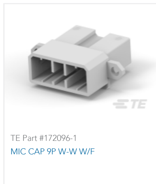
TE Part #172096-1 MIC CAP 9P W-W W/F