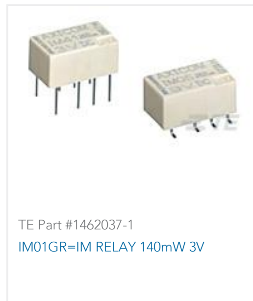
TE Part #1462037-1 IM01GR=IM RELAY 140mW 3V