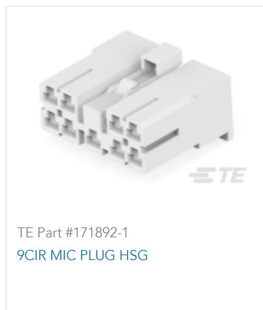
TE Part #171892-1 9CIR MIC PLUG HSG