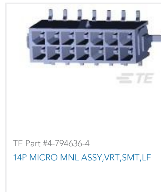
TE Part #4-794636-4 14P MICRO MNL ASSY,VRT,SMT,LF