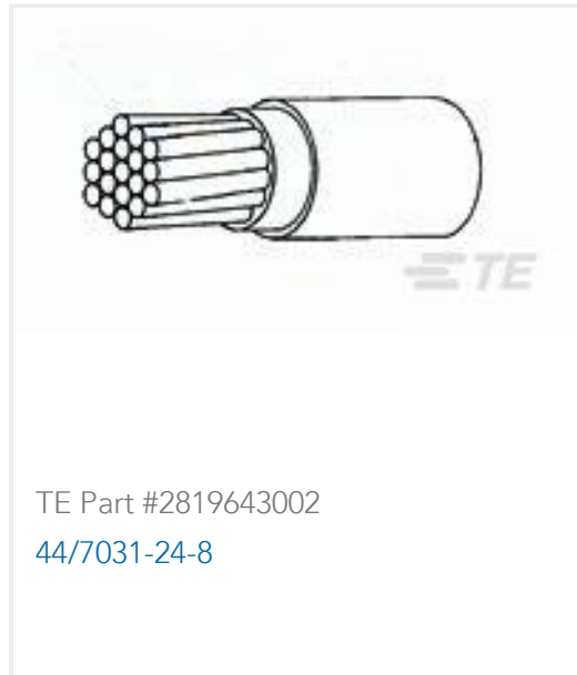
TE Part #2819643002 44/7031-24-8