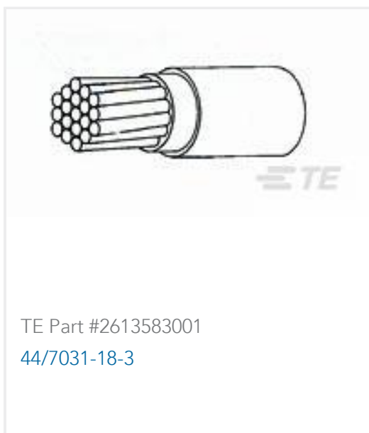
TE Part #2613583001 44/7031-18-3