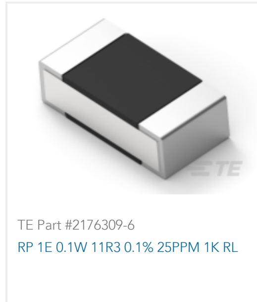
TE Part #2176309-6 RP 1E 0.1W 11R3 0.1% 25PPM 1K RL