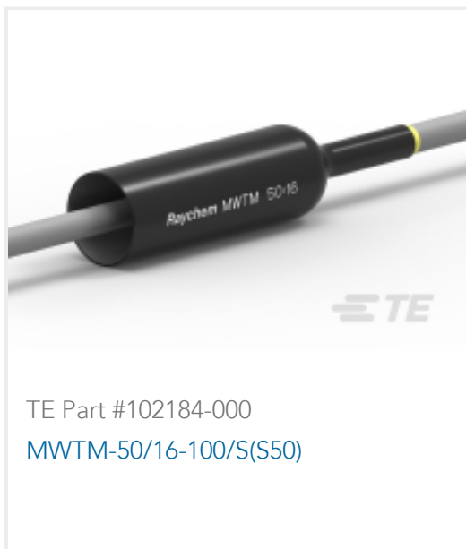
TE Part #102184-000 MWTM-50/16-100/S(S50)