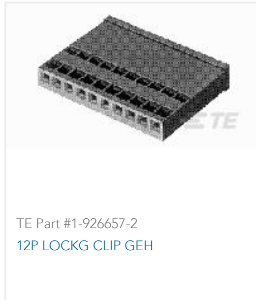
TE Part #1-926657-2 12P LOCKG CLIP GEH