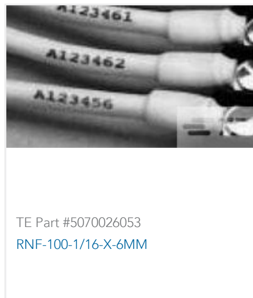
TE Part #5070026053 RNF-100-1/16-X-6MM