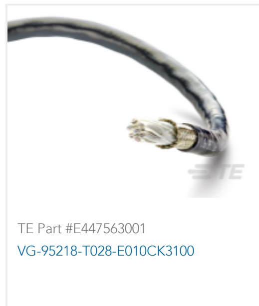
TE Part #E447563001 VG-95218-T028-E010CK3100