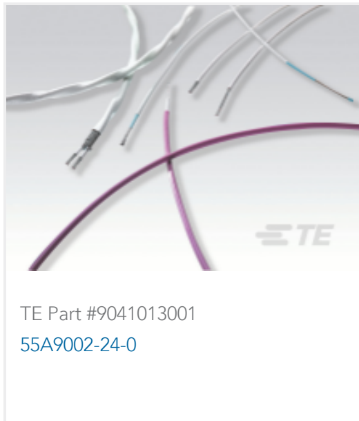
TE Part #9041013001 55A9002-24-0