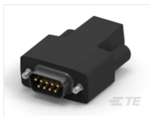
TE Part # 1-747944-5 09 SHLDG ENCL PLUG, LEAD FREE