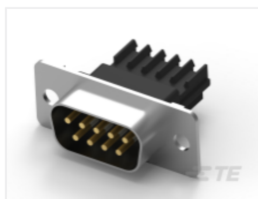
TE Part # CAT-AM7-248H3 IDC D-Sub: Plug Assembly, Wire to Wire, Signal, 2.77 mm