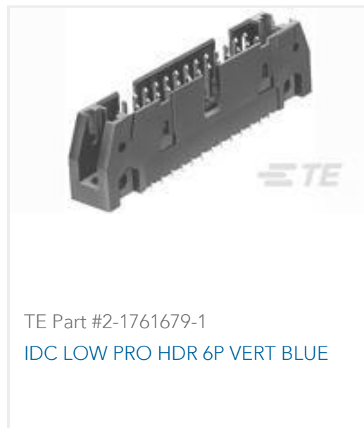
TE Part #2-1761679-1 IDC LOW PRO HDR 6P VERT BLUE