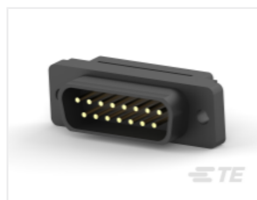
TE Part # CAT-AM7-H3 IDC D-Sub: Plug Assembly, Low Profile, Signal, 2.77 mm