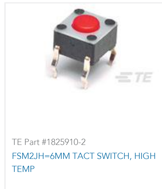
TE Part #1825910-2 FSM2JH=6MM TACT SWITCH, HIGH TEMP