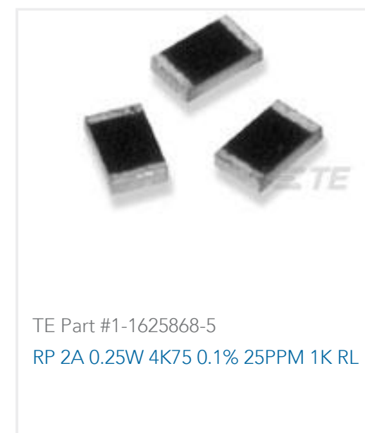
TE Part #1-1625868-5 RP 2A 0.25W 4K75 0.1% 25PPM 1K RL