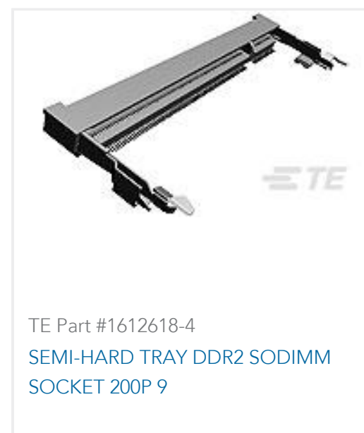
TE Part #1612618-4 SEMI-HARD TRAY DDR2 SODIMM SOCKET 200P 9