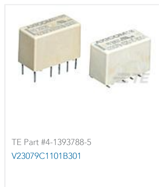
TE Part #4-1393788-5 V23079C1101B301