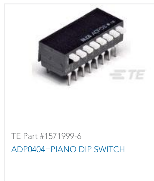
TE Part #1571999-6 ADP0404=PIANO DIP SWITCH