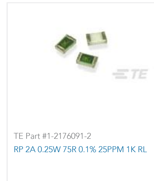
TE Part #1-2176091-2 RP 2A 0.25W 75R 0.1% 25PPM 1K RL