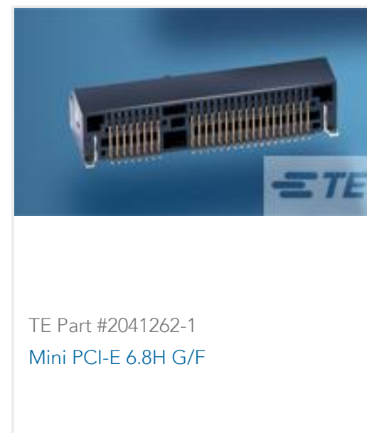
TE Part #2041262-1 Mini PCI-E 6.8H G/F