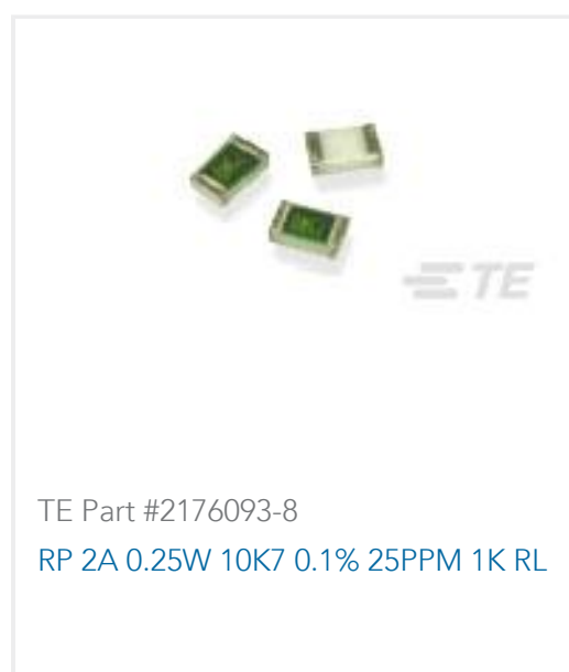
TE Part #2176093-8 RP 2A 0.25W 10K7 0.1% 25PPM 1K RL