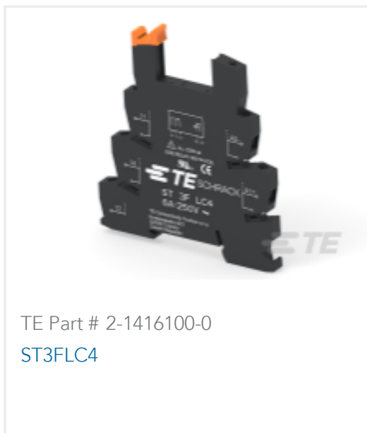
TE Part # 2-1416100-0 ST3FLC4