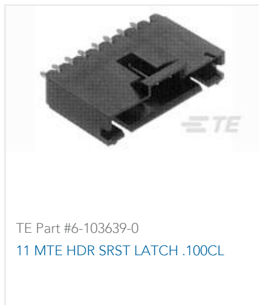
TE Part #6-103639-0 11 MTE HDR SRST LATCH .100CL