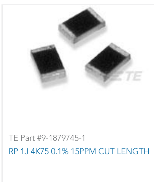
TE Part #9-1879745-1 RP 1J 4K75 0.1% 15PPM CUT LENGTH