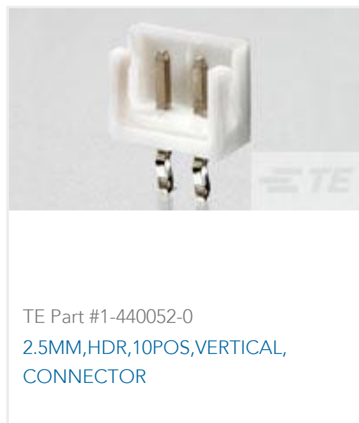
TE Part #1-440052-0 2.5MM,HDR,10POS,VERTICAL, CONNECTOR