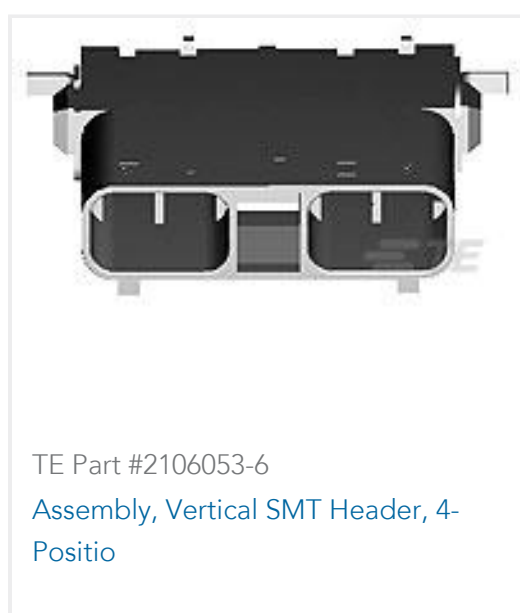
TE Part #2106053-6 Assembly, Vertical SMT Header, 4- Positio