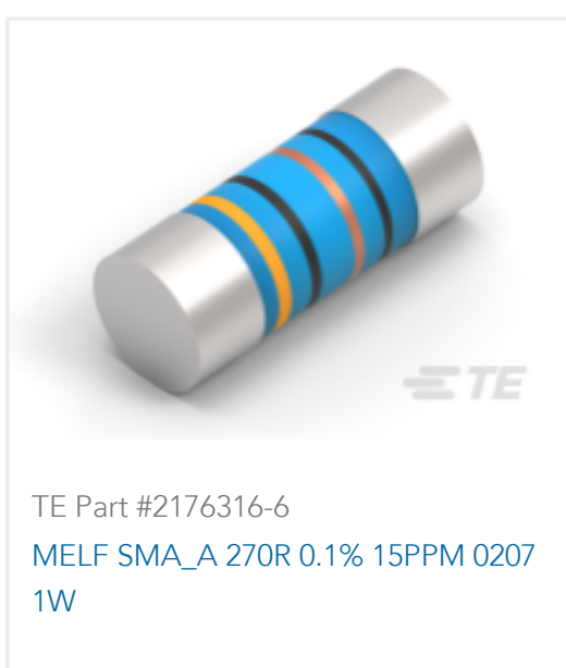
TE Part #2176316-6 MELF SMA_A 270R 0.1% 15PPM 0207 1W