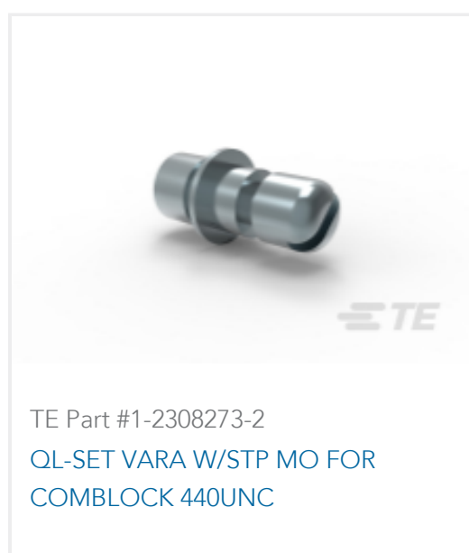
TE Part #1-2308273-2 QL-SET VARA W/STP MO FOR COMBLOCK 440UNC