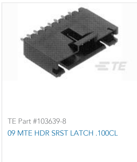
TE Part #103639-8 09 MTE HDR SRST LATCH .100CL