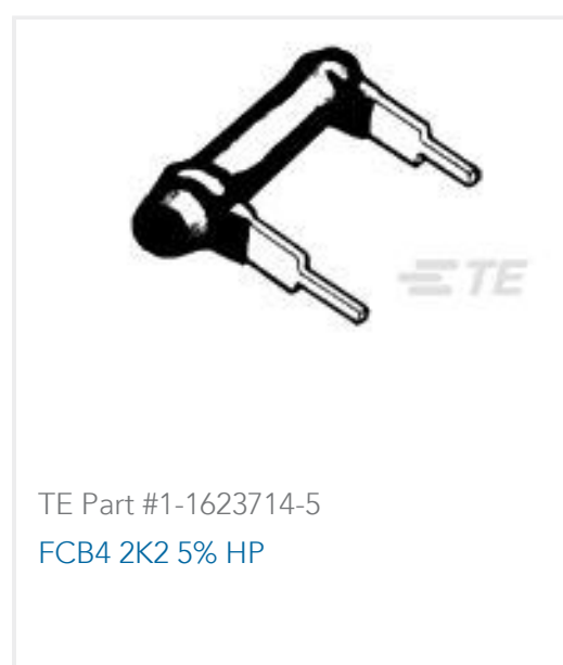
TE Part #1-1623714-5 FCB4 2K2 5% HP