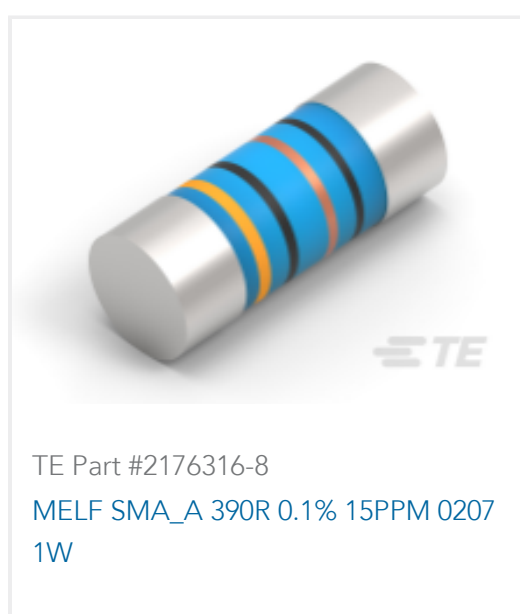
TE Part #2176316-8 MELF SMA_A 390R 0.1% 15PPM 0207 1W