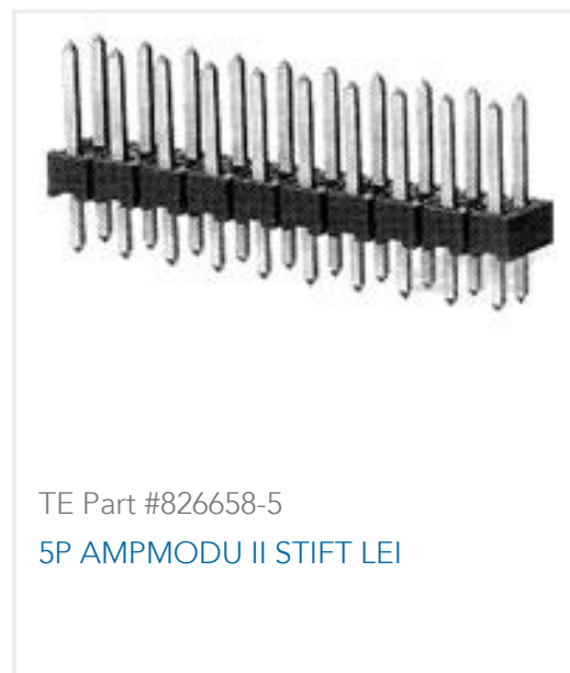
TE Part #826658-5 5P AMPMODU II STIFT LEI